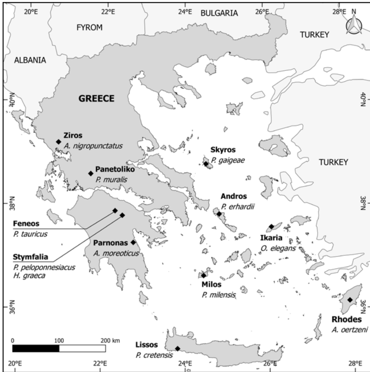
Fig. 1. Map of the collecting sites in mainland and insular Greece, NE Mediterranean Basin.

(1997). Since body temperature may affect caudal autotomy (Bustard, 1968; Daniels, 1984), lizards were allowed to thermoregulate for two hours in a specially designed terrarium (100 × 25 × 25 cm) with two ice bags at one end and two heating lamps (100 W and 60 W) at the other end that provided a thermal gradient ranging from 10 to 50 °C (Van Damme et al., 1986). After achieving its preferred body temperature, each lizard was placed in a terrarium with cork substrate in order to maintain good traction during predation simulation. We used a pair of calipers to simulate the bite of a preda-