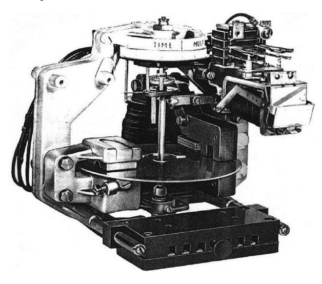
Figure 1: Example of electromechanical relay (disc type time over-current)

This generation of static relays became quickly very popular and found a large place in power system protection.