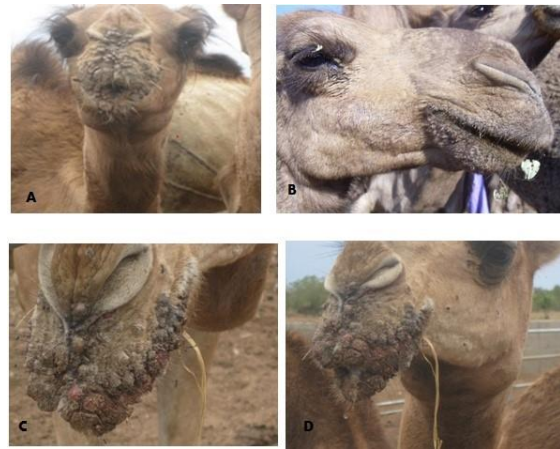
Fig. 2. Representative clinical signs of contagious ecthyma in camels observed in Nigeria. (A): Proliferative scabby skin lesion on the lips and nose of a camel in a camel farm in Bauchi, Nigeria. (B): Contagious ecthyma lesions around oral commissures in a camel in a live animal market in Jos, Nigeria. (C and D): Severe bloody and multiple scab lesions of contagious ecthyma in a camel in the Bauchi camel farm.

From the farm in Bauchi, the clinical signs observed were proliferative skin lesions, papules and scab lesions on the lips and nares (Fig. 2A, 2C, and 2D).