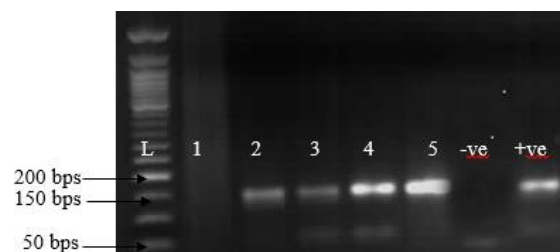
Fig. 3. Agar gel electrophoresis of PCR product of RPO132 gene of camel parapoxvirus. (Lanes 1-5): Samples collected from suspected cases. The positive samples were amplified at 140 bp fragment. (L): DNA marker (New England BioLab®). (+ve): Positive control. (-ve): Negative control.

A morbidity of 53.3% (8/15) was recorded without mortality. Initial diagnosis of CCE on the farm was based on clinical signs, as samples collected were inappropriate for laboratory diagnosis. The samples from Plateau (Fig. 2B) and Zamfara states were collected from a live animal market and abattoir from camels showing signs suspected to be CCE. Clinical signs observed in the cases of CCE are presented in Table 1, which include scab lesions on the mouth, nares and neck. A total of 5 samples of skin (n=1), scabs (n=1), lungs (n=1), intestine (n=1) and liver (n=1) were submitted to the laboratory and analyzed (Table 1). Grossly, nodular lesions were observed on the lungs, liver and intestine during postmortem examination. CPPV was detected by specific PCR amplification of RPO132 gene segment of PPV in 80% (4/5) of the samples (Fig. 3). Furthermore, CPPV was detected in samples of scab (1), skin (1), intestine (1) and lungs (1) (Table 1). The amplified PCR products yielded 140 bp gene fragments for the partial RP0132 gene of the CPPV (Fig. 3).