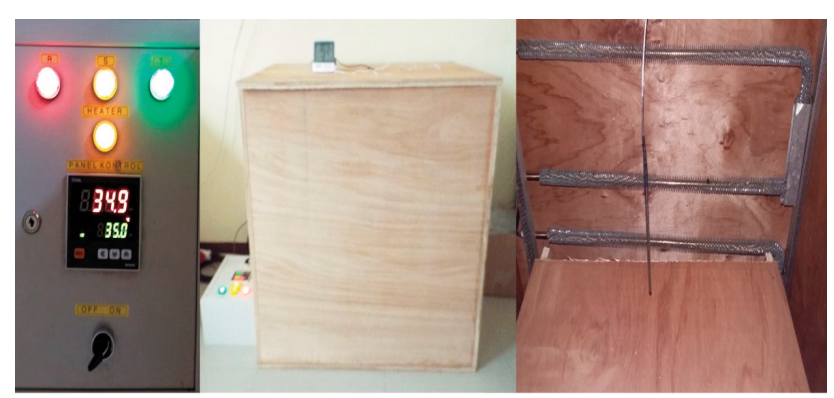
Termostat Heater Box Heater Element Figure 2. The air equipment-heater

Figure 1. The kinds of test nutmeg seeds