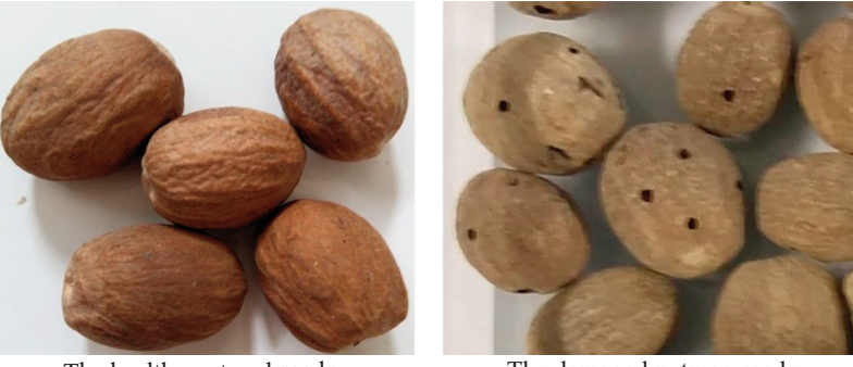
The healthy nutmed seeds