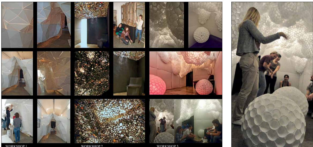
Fig. 4. Final model: Elements, materials and shapes – shaping the ambient.

The strengths of such an approach to work are two-fold. Firstly, they are related to the teaching and learning process that connects all participants into an interactive group of cooperation, dialogue and work, culminating in a spatial installation. Such teaching and learning approach is already part of the curricula of some courses; however, the implementation varies depending on the problem and goals set. Secondly, the strengths relate to the goals of the teaching process, i.e. trying to familiarize the students with new materials, their properties and possibilities at hand.