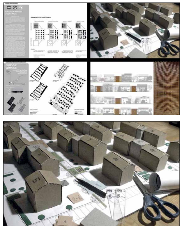
Fig. 3. Symbiosis of existing and new inhabitants.

The work was awarded the highest Slovenian university award, i.e. The Prešeren Award of the University of Ljubljana for students for 2011/2012. The work was