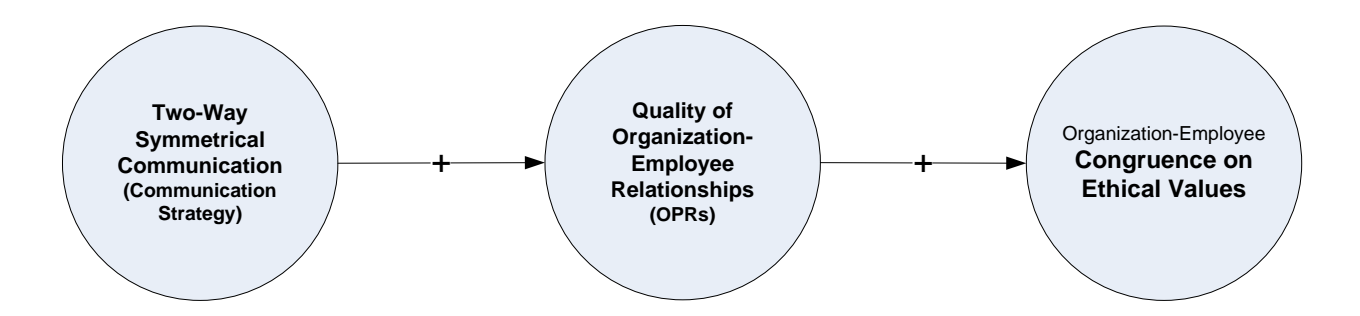
Figure 4. Alternative conceptual model with complete mediation.