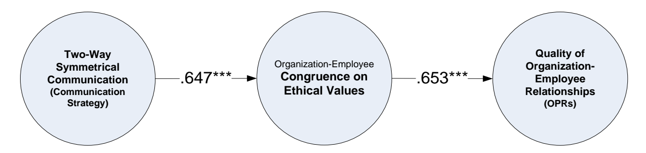
Figure 2. The conceptual model with complete mediation (with paths).

We also proposed an alternative model specifying the person-organization fit as an outcome of organization-public relationships (see Figures 3 and Figure 4). This alternative model is a viable specification in that better (or worse) relationships between an organization and its employees would increase (or decrease) the employees' internalization of organizational ethical standards. In addition, the alternative model could be specified as a complete versus partial mediation model between communication strategy and person-organization fit via organization-public relationships. The standardized path coefficients were provided in Figure 3 and Figure 4. The data-model fit indices results indicated that for partial mediation (see Figure 3) it had a \chi^2/df