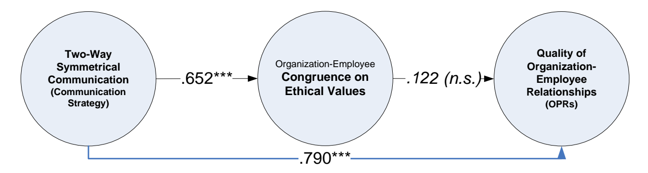
Figure 1. The conceptual model with partial mediation (with paths).

that the complete mediation condition did not meet the criteria, but the partial mediation condition did. Thus the partial mediation model (see Figure 1) could be retained as a valid structure for the data.