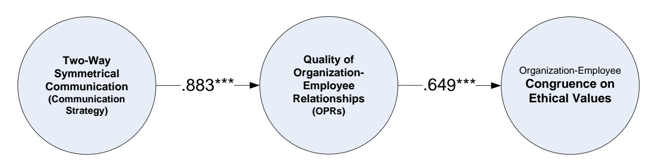
Figure 4. The alternative model with complete mediation (with paths).

When both the hypothesized model and equivalent model fit, most researchers retain the originally hypothesized one (Hershberger, 2006, p. 36); however, it seemed more important in this study to explore the implications of both models. The hypothesized partial mediation model had one insignificant path ( z statistic = 1.39) from