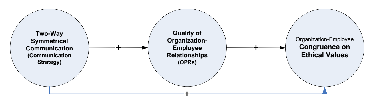
Figure 3. Alternative conceptual model with partial mediation.

organization-public relationships) on person-organization fit. Further research (see Ki & Hon, 2007) also showed that organization-public relationships can predict a public's attitude, or "internal evaluation of an object" (p. 6), which is similar to person-organization fit on ethical values (perceptions of congruence of ethical values). Equally plausible is the idea that those employees experiencing good relationships with their organization are more likely to internalize the organizational norms and ethical standards. Testing an "equivalent" nested model (e.g., with the same set of variables but different causal directions) seemed necessary. In this model communication strategies' effect on person-organization fit on ethical values is partially (see Figure 3) and completely mediated (see Figure 4) by organization-public relationships. Testing and reporting plausible alternative models are desirable when there are multiple rival models whose theoretical implications are different but statistical properties (e.g., identical measures and model fit) are equivalent (Hershberger, 2006; Williams, Bozdogan, & Aiman-Smith, 1996).