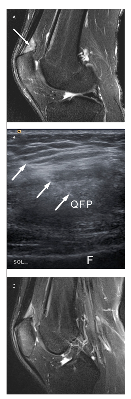
Figure 2: A 31-year-old male with anterior knee pain and suprapatellar tenderness on physical examination. Midsagittal FS T2W (a) MR image (TR/TE, 2728/60 ms) at baseline (Day 0) shows edema-like signal changes with mass effect (posterior bulging) at the quadriceps fat pad (arrow). Oblique parasagittal US image (b) shows the injection needle (arrow) traversing through the quadriceps fat pat (QFP) (F, femur). Midsagittal FS T2W (c) MR image (TR/TE, 4020/64 ms) at 6-month follow-up (Day 180) shows persistence of edema-like signal changes at the quadriceps fat pad.

A total of 2 mL [1 mL bupivacaine hydrochloride (Marcaine 0.5%, 5 mg/mL, blinded) and 1 mL methylprednisolone (40 mg/mL, blinded)] was injected into the fat pad of each consenting patient within five days of routine knee MRI after their pain scoring at the baseline session. All injections were administered with the patient supine and the knee under slight flexion (a small pillow was placed under the joint). Following administration of 3–5 mL prilocaine hydrochloride (Priloc 2%, 20 mg/mL, blinded) to