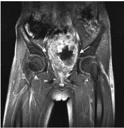
Fig. 3. — Coronal post-gadolinium T1-weighted fat sat image shows a large irregularly enhancing, centrally located pelvic mass (arrows).

and the presence of two new intraperitoneal masses (5.4 x 5.7 x 5.1 cm, 5.3 x 5.2 x 5.7 cm) (Fig. 4) The disease was progressive and chemotherapy was unsuccessful. The patient was given palliative care.