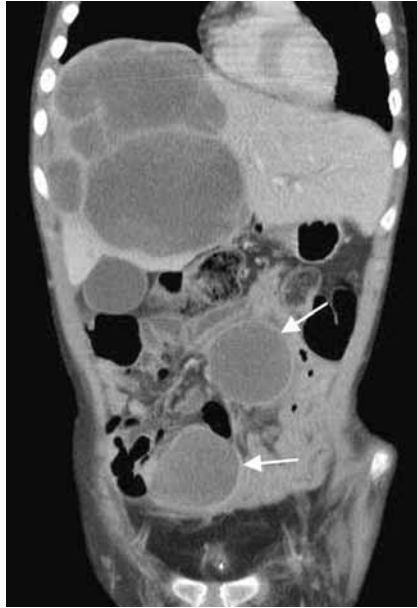
Fig. 4. — Interval computed tomography during second chemotherapy shows a significant enlargement of the liver lesions and the presence of two similar intra-peritoneal lesions (arrows).

Inflammatory myofibroblastic tumor (IMT) is a distinct tumor of proliferating myofibroblasts with an associated inflammatory infiltrate. The tumor rarely undergoes malignant transformation (1). IMTs most often are seen in the lungs of young adults, but there have been reports in children, and in various anatomic locations (6-8). Extrapulmonary IMTs in children have been described involving the mesentery (1, 9), retroperitoneum, abdominal soft tissues, liver (10), bladder (11, 12), mediasti-