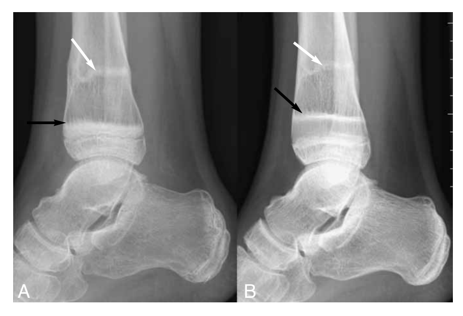
Fig. 3. — Digital plain films of the ankle obtained two (A) and twenty months (B) after the administration of biphosphonate. A typical metaphyseal bandlike sclerosis (black arrow) or "zebra line" has developed near the cartilaginous grow plate after two months and this band typically migrated and significantly decreased after 20 months. White arrow = healed fracture.

Digital plain films of the ankle obtained two (Fig. 3A) and twenty months (Fig. 3B) after the administration of biphosphonate were retrieved from our picture archiving system. A typical metaphyseal band-like sclerosis or "zebra line" had developed near the cartilaginous