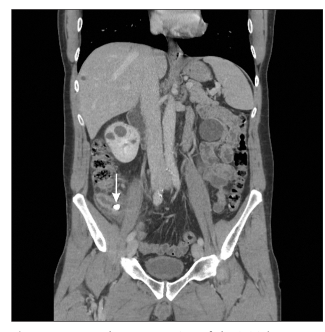
Figure 2: Coronal reconstruction of the initial contrastenhanced CT performed at the acute on set of appendicitis. The appendix shows a thickened wall, fat stranding, free fluid and the embedded appendicolith. No obvious signs of a macroscopic interruption of the appendiceal wall was noted.

it is often associated with more severe appendicitis and a higher perforation rate [5].