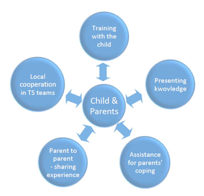
Figure 1. The intervention modules in the PIH.

Parental data in the study were gender and clinical stress. Inclusion criteria for children were a CP diagnosis and age between 2 and 4 years. The children represented all Gross Motor Function Classification System (GMFCS) levels from I to V (Palisano et al. 2008). Exclusion criteria were comorbid autism spectrum disorders, extensive visual and/or hearing impairments, and receptive language disorder. At baseline 16 parents had children from 2 years to 2 years and 11 months (2–3 years),