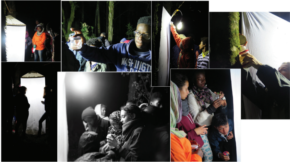
Figure 2. Pictures from the light-trapping session with two classes of the French High school Guebremariam of Addis- Abeba (Seq#3). The students developed specific entomological skills from the different methods and recognised the choice of the trap needed to target a given insect. The students worked at night and respected safety procedure with toxic products (see killing jars) and finally were able to collect live insects manually. The second light trap technique (i.e. actinic lamp) is shown on the two left pictures while the manual light trap is shown on the four right-side pictures.

knowing the names of collected insect specimens. The illustrated plates (Figure 3), used for identifying the insects, were first presented prior to the collection and used while sampling. Once the groups were fully prepared, GPAL demonstrated how to sample the insects on the sheet to individual students. Students then captured insects on the sheet directly using plastic jars or forceps (Figure 2). At least one instructor supervised one light trap during the entire duration of the fieldwork. The instructors ensured that each group collected arthropods representing the majority of the focal taxonomic groups found on the white sheet, reported the time, date, type of light trapping and weather conditions in their notebook before switching to the second light trap. The instructors also ensured that each group collected insect samples at least twice from each of the two light traps. Between light trapping events, one out of the three groups moved towards the camp in order to start sorting, labelling and organising the insect specimens. We sampled insects until 2300 h or 2400 h. Instructors and some volunteering students then organised and transported the equipment back to the camp and cleaned the site.