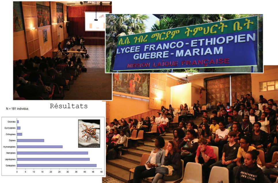
Figure 5. The French High School Guebre-Mariam, managed by the Mission laïque française and government-regulated with the AEFÉ (Agency for French education abroad). An example of results produced during the programme and, inside the high school, the amphitheatre that offers the opportunity for students to organise and follow their own symposium, a chance to develop maturity, motivation, leadership and self-confidence (Seq#5#6).