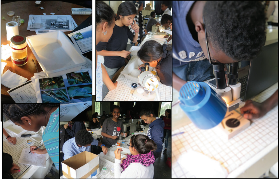
Figure 4. Pictures of the laboratory activities including the organisation, sorting and counting of the collected specimen using a systematic procedure under microscope (Seq#4).

the diagnostic characteristics effectively. We also recommended the use of a projector, which offers a direct visualisation of the differences in insect morphology illustrated by high-resolution pictures or diagrams. Lepidoptera, Coleoptera and Hemiptera were the most successfully identified taxa. Some large-sized Hemiptera in Coreidae, Reduviidae and Pentatomidae families were sometimes confused with beetles. Mantodea and Phasmatodea were well distinguished from other orders after the first observation. Separating the different orders in the field (after observation and collection) and the lab (under microscope) received positive feedback by the students and was generally perceived as less challenging than the identification of specimens at higher taxonomic level (family or genus). However, confirmation of students' identifications by instructors was needed. This often generated valuable discussions within a small group of students on the process of discriminating key morphological features amongst insect orders and on functional attributes related to ecosystem services (e.g. pollen-carrying apparatus in bees).