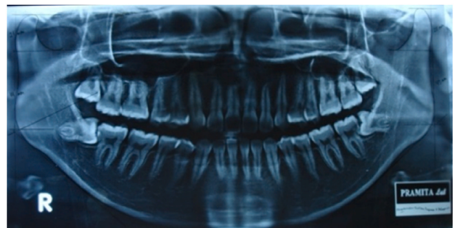
Figure 2. The measurement of panoramic radiograph that used in this study.

process). RH is the distance from CO to the Go’ (the reflection of subdivision tangent from ramus and corpus mandibular to the ramus borderline). In order to obtain vertical mandibular symmetry based on the ratio of condylar and ramus height (Kjellberg’s technique), the numerator should be smaller