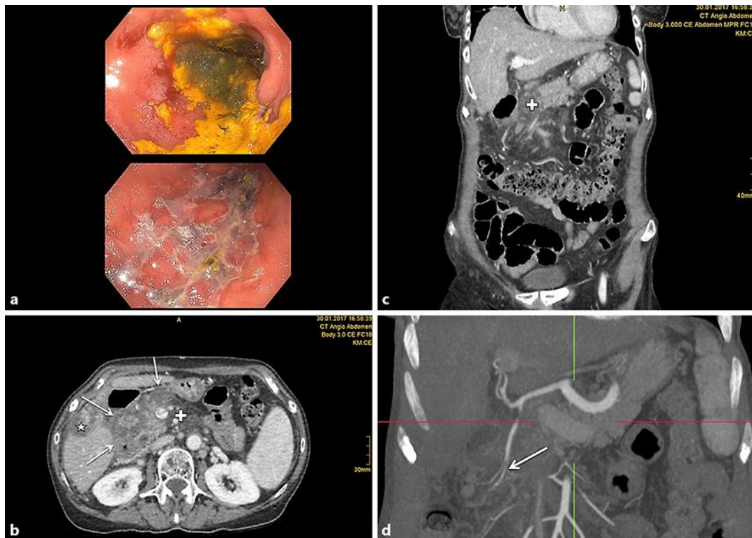
Fig. 1. a Esophagogastroduodenoscopy 4 days after DEB-TACE revealed severe duodenal ulceration particularly near the duodenal bulb. Endoscopy revealed no signs of acute bleeding. The localization and close temporal relation between the clinical symptoms and the intervention implied the ulceration was ischemic and caused by inadvertent carryover gastrointestinal vessel embolization during TACE. Due to the high risk of perforation, biopsies for histological verification of ischemic etiology were waived. b Contrast-enhanced abdominal CT-angiography was performed subsequent to the endoscopic diagnosis of severe duodenal ulceration. Apart from inflammatory alterations of the duodenal wall, the CT scan revealed severe necrotizing pancreatitis of the pancreatic head and at the transition to the pancreas corpus. There were no radiological signs of bacterial superinfection or perforation. Asterisk: necrotic HCC; arrows: ischemic duodenum after TACE; cross: necrotic pancreas after TACE. c Hypodense presentation of the pancreatic head by contrast-enhanced abdominal CT indicated necrotizing pancreatitis after TACE. Cross: necrotic pancreas after TACE. d Frontal section of abdominal CT-angiography with adequate perfusion of the superior and inferior pancreaticoduodenal arteries. Arrow: superior pancreaticoduodenal artery; red line: horizontal axis; green line: longitudinal axis.