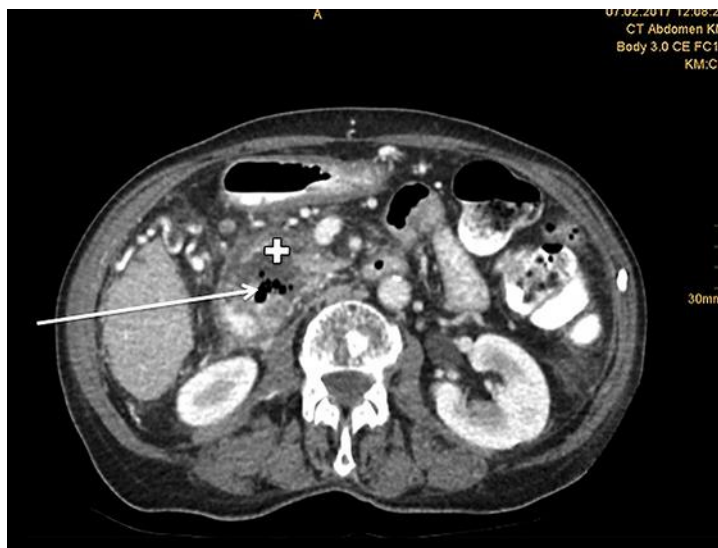
Fig. 2. Eight days after first diagnosis of ischemic duodenal ulceration, the patient complained of strong abdominal pain in the upper right quadrant and a CT scan was performed immediately. Newly occurred prominent air trapping in the area between the pancreatic head and the duodenum indicated contained juxtapapillary perforation. Since the patient remained stable, the authors decided not to investigate the contained perforation endoscopically due to the suspected risk of enlargement of the perforation size by air insufflation during the examination. Cross: area between pancreatic head and duodenum; arrow: air trapping indicating juxtapapillary perforation.