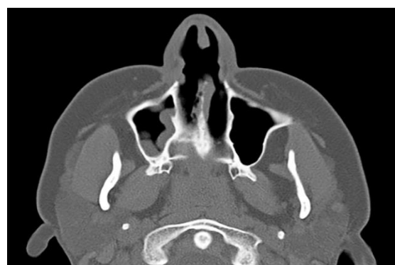
Fig1: CT scan of sinus revealing a thickness in the right maxillary sinus and a defect in the anterior aspect of the nasal septum.

The coronal and axial cut of computed tomography (CT) reconstructions of nasal soft tissues and paranasal sinuses revealed mucosal thickening in the right maxillary sinus and a defect in the anterior aspect of the nasal septum with an approximate diameter of 13 mm (Fig.1). The nasal septum biopsy revealed respiratory mucosa with ulceration, acute inflammation, and granulation tissue formation (Fig.2).