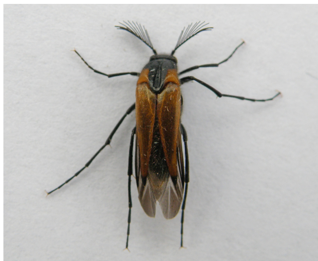
Fig. 3. Metoecus paradoxus , male.

Biology. Heitmans & Peeters (1996) summarised the complex life history of M. paradoxus which is an obligatory parasite, developing in full-grown larvae of social wasps of the genera Vespula Thomson, 1869 and Dolichovespula Rohwer, 1916. According to Van Oystaeyen et al. (2015), emerged beetles mimic the methylalkane profile of their main host V. vulgaris (Linnaeus, 1758) to avoid detection. Specimens collected by the authors (Fig. 3) evidently penetrated into the building from a wasp nest located in the neighbourhood. Some females still bore the remnants of pupal shell on the body.