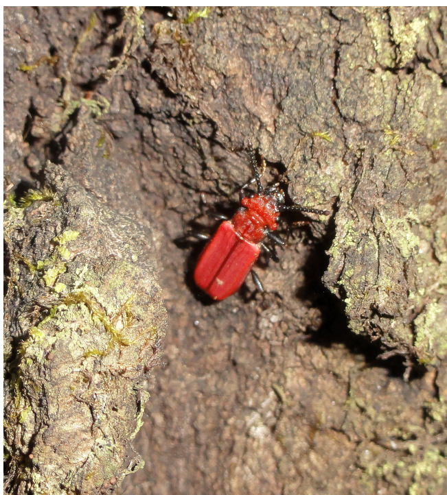
Fig. 2. Cucujus cinnaberinus , male.

Biology. Saproxyllic species, living under the bark of a variety of broad-leaved trees and rarely on conifers (Nieto et al., 2010). In Finland it prefers fallen aspen logs with loose bark (J. Siitonen, pers. comm.). Larvae and adults are predators of saproxyllic invertebrates (Mazzei et al., 2011). Horák et al. (2010) discussed habitat preferences of this species in the Czech Republic.