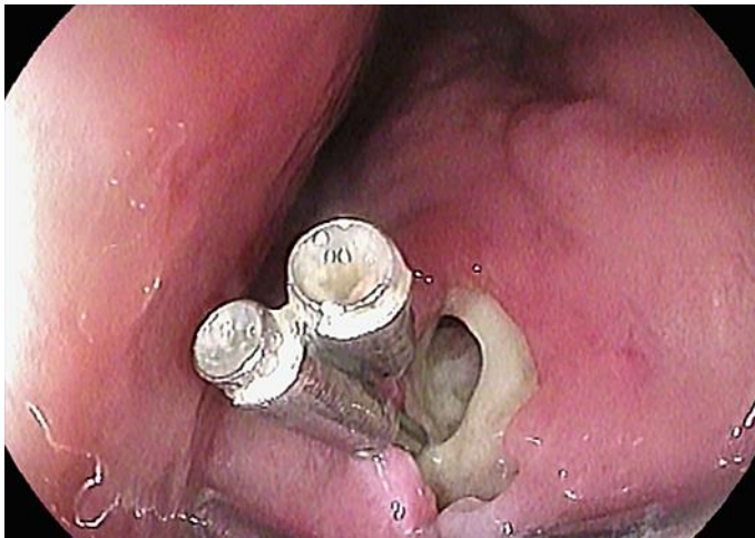
Fig. 4. Defect of 3 × 3 mm in the region of the initial incision. The area had been previously closed with clips. The edge and the bottom of the defect are covered with fibrin.