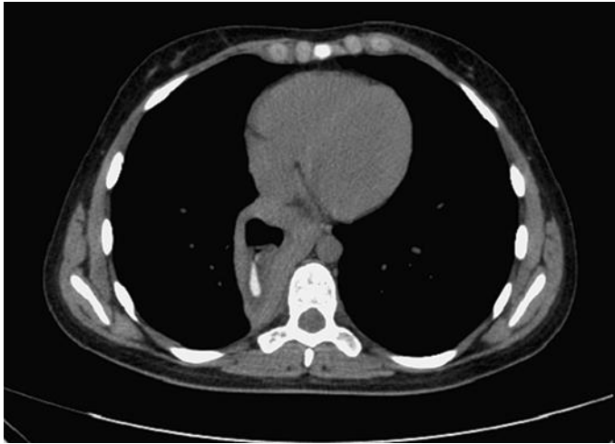
Fig. 5. Chest computed tomography 11 months after surgery. Thickening of the esophageal wall remains up to 9 mm.