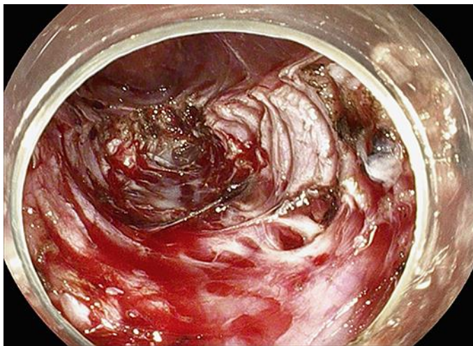
Fig. 2. Myotomy of the thickened circular muscle of the patient's esophagus, showing the view from the level of the muscular layer.