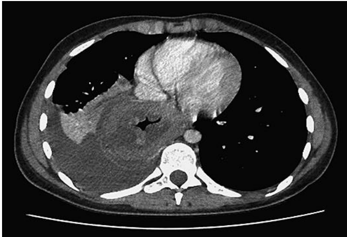
Fig. 3. Thickening of the esophageal wall in the patient, detected by computed tomography of the thorax with oral contrast. The thickening was up to 22 mm.