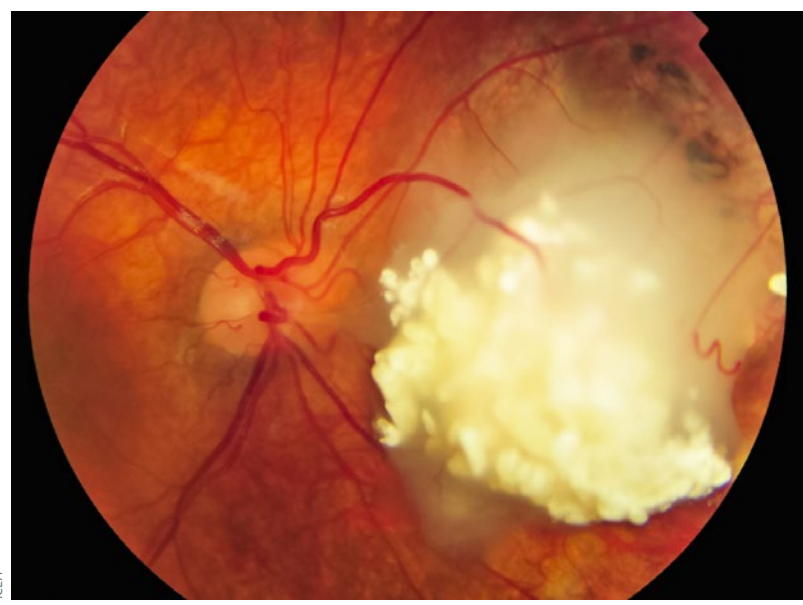
Figure 2 Multifocal retinoblastoma in the left eye of a 1-year old child.

Figure 1 A right eye nasal retinocytoma incidentally found by an optometrist in an asymptomatic 8-year old boy with 20/20 vision. The patient was thereafter monitored in a specialised retinoblastoma service, with unchanged tumour on consecutive examinations.