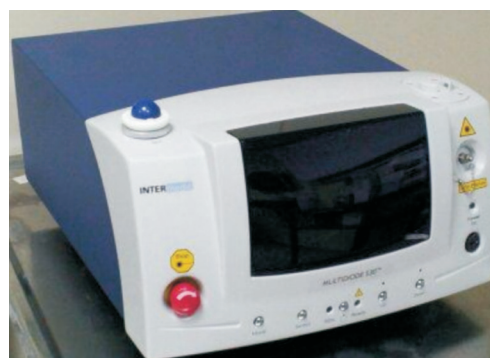
Figure 1 Multi-diod laser TM S30-OFT device.

After operative site antisepsis using povidone iodine 10%, the upper and lower canaliculi were dilated using Bowman probes. A rigid nasal endoscope with a 0-degree angle was inserted into the nose. Multidiode laser (Intermedical Multidiode S-30 OFT; Figure 1) was used. The settings were adjusted for each patient being at 10 W energy, 400ms pulse, 400ms pause and contact mode. The radius of the diode laser fiberoptic probe used was 600 µm. This probe was introduced into the lacrimal sac through the upper and lower canaliculi, until the transillumination of the aiming beam could be seen via the nasal endoscope just lateral and superior to the middle turbinate. Of 980 nm diode laser was applied until the largest possible osteotomy was achieved. The area of osteotomy was expanded to approximately 8-10 mm in diameter, and coagulated using diode-laser, carbonized tissue was removed under endoscopic guidance. Nasolacrimal passage was irrigated using 0.9% NaCl from both upper and lower punctums. In all subjects, bicanalicular intubation was performed. Totally 23-gauge silicone tube was then passed through the inferior