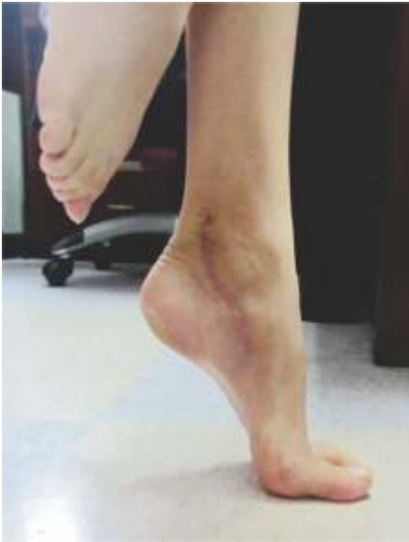
Fig. 3: Six Month Post Operative Patient Able to Resume Position of 'en pointe'