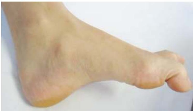
Fig. 1: Flexion Attitude of the Big Toe

was put on a posterior slab for 6 weeks. Rehabilitation process started after 6 weeks, with gradual range of motion and muscle strengthening exercise. She was allowed to resume her ballet dancing after 3 months. On final follow up she was able to resume the position of 'enpointe' with no more triggering of the big toe and pain free (Fig. 3).