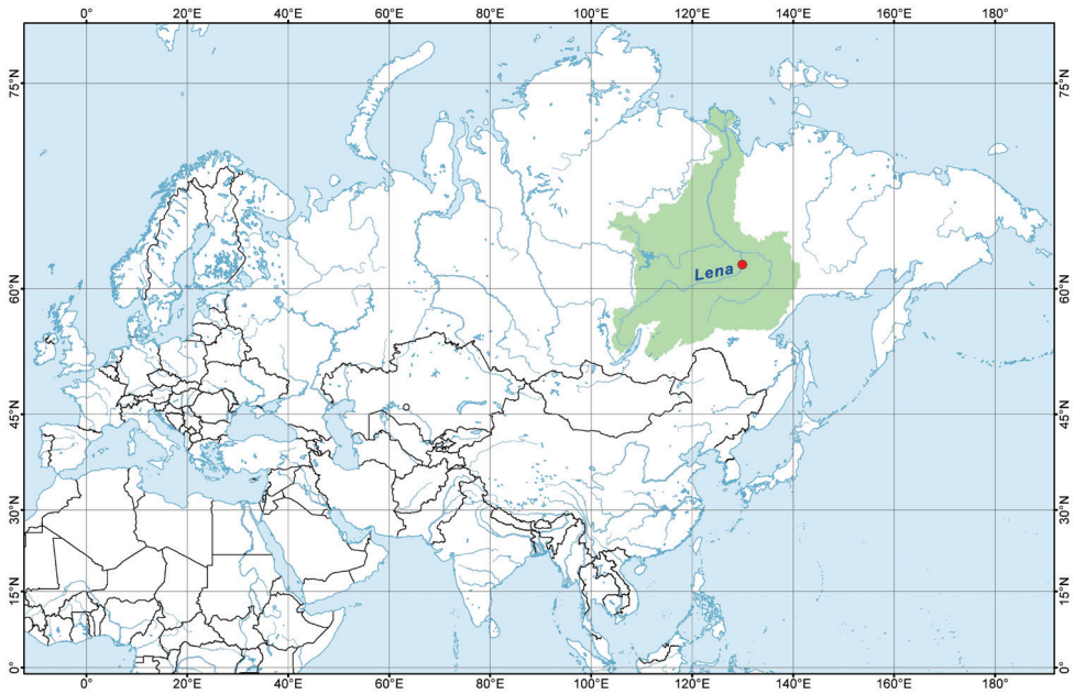
Figure 1. Map of Lena River basin, Eastern Siberia, with occurrence of the leech-bryozoan association in a floodplain lake (red dot).