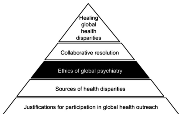
Figure 1. The ethical practice of global psychiatry requires understanding of motivators for participation in global health outreach and the social determinants of health as well as skills in the collaborative resolution of resultant psychiatric health disparities. 14

understand the values that drive their engagement, the social determinants of health, and also what those social determinants of health are. Then, psychiatrists must be able to translate the desire to redress these contributors to global psychiatric illness into effective and collaborative interventions. Figure 1 depicts the larger context surrounding the purpose of global psychiatry. Our focus will be on the shaded area—the ethics of global psychiatry.