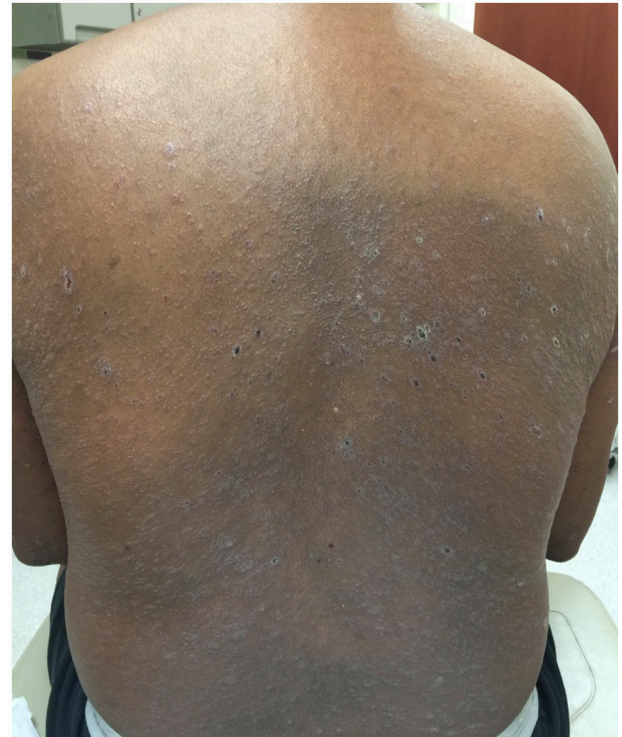
FIGURE 1 | Clinical image of the cutaneous eruption that developed after six cycles of nivolumab. On the back, there were widespread and numerous 3–10 mm pink to pink-brown thin flat-topped papules and plaques with scale.