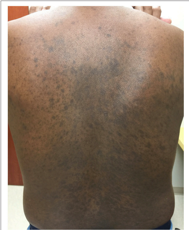
FIGURE 3 | Clinical image after successful treatment with NBUVB. On the back, there were widespread and numerous hyperpigmented macules coalescing into patches. There was no erythema or scale.