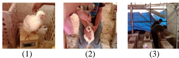
Figure 2. Research implementation to measure metabolic energy

Chickens were weighed to know their weight after fasting phase. Feed (30 g/head) was force-fed to 10 chickens. Excreta were collected 24 h after feeding. Five chickens were re-fasted for 24 h (water was given ad libitum ) to measure endogenous nitrogen and energy. The implementation of the treatment was illustrated in Figure 2.