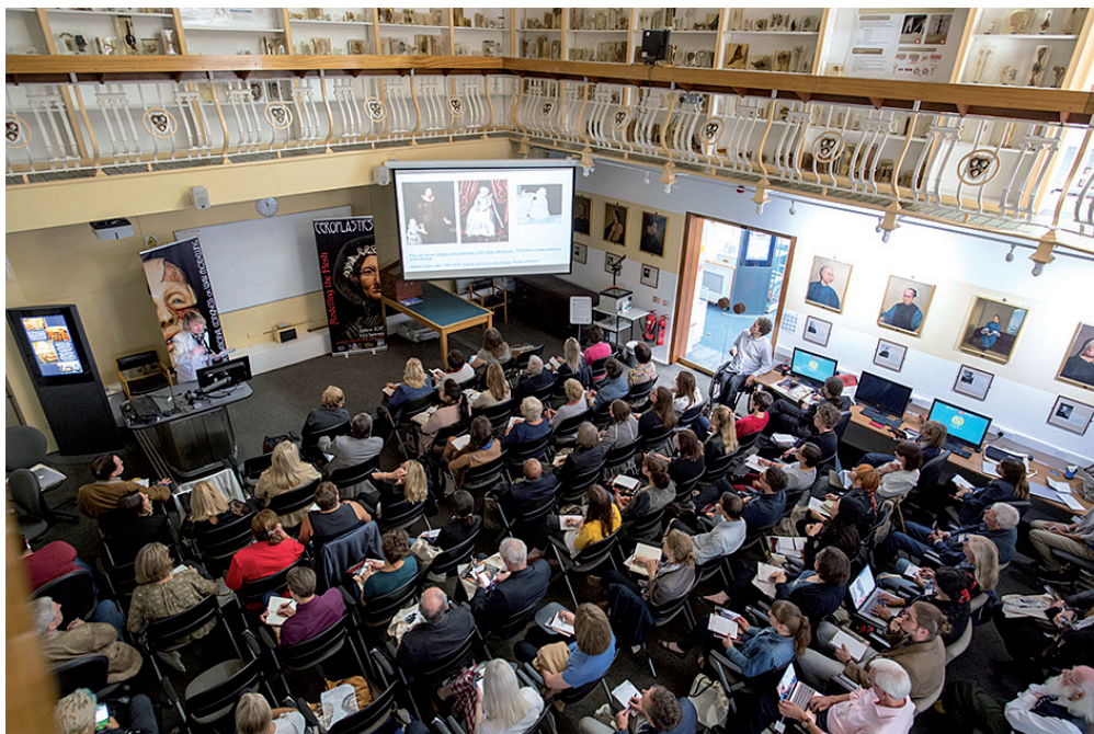
Fig. 4. The Gordon Museum of Pathology: The Percy Roberts Theatre with the collection of Lam Qua's paintings

A key principle of the HT act is that all human bodies and materials of human origin within its scope should be treated with respect and dignity. In relation to the public display of human material, this principle applies both to those showing the material, and