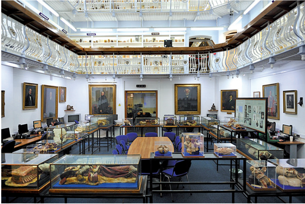
Fig. 5. The Gordon Museum of Pathology: wax model collection of Joseph Towne

to those viewing it. The display of human materials raises some important ethical issues; this acknowledges their unique status within museum collections and the special responsibilities placed on those who acquire and display them. All the specimens present are donations so, even if they are to be used for educational purposes, they have to be treated with respect and dignity.