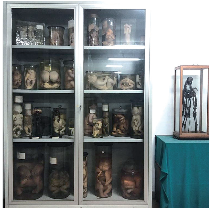
Fig. 3. A cabinet in the Museum of Pathological Anatomy of University of Padua