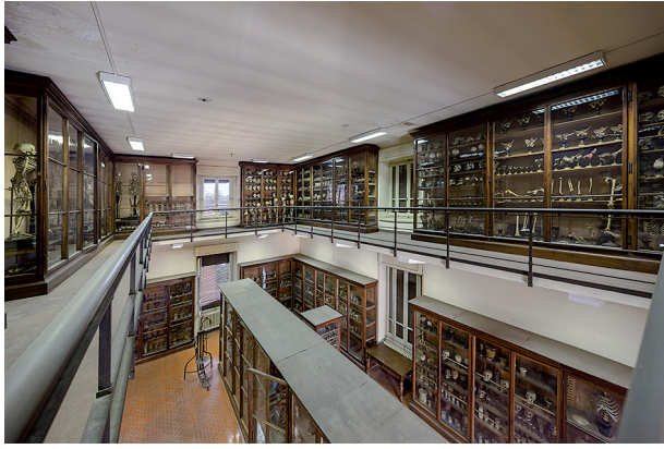
Fig. 1. Anatomical Museum of Pavia, view from the top

1825), Antonio Scarpa (1752-1832), Bartolomeo Panizza (1785-1867), and Giovanni Zoja (1833-1899) [1]. In particular, Antonio Scarpa was the first director and collected precious preparations describing some of his most important discoveries on hernias, the sense of smell and hearing organs, but also the heart's blood vessel and nerves. Antonio Scarpa always preferred natural anatomical preparations obtained partly by desiccation or maceration [2], partly by using resins and wax, and partly by preserving them in "wine spirit", kept in custom-made glass vases that were made following his directions. He also preserved entire human bodies, creating anatomical statues [3].