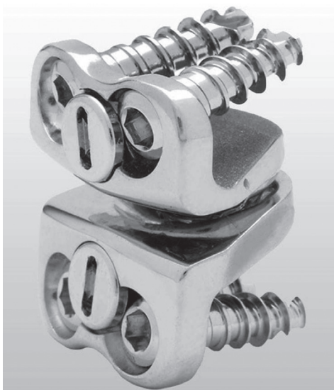
Fig. 1. Prestige artificial cervical disc.

A metal-on-plastic design called the Bryan disc was introduced in the late 1990s. The Bryan disc is a single-piece unconstrained device with a completely variable instantaneous axis of rotation, comprising a polyurethane core that articulates between two titanium alloy shells (Fig. 2). It provides physiological coupled translation–flexion–extension, and allows for shock absorption. Early research reports of the Bryan disc have demonstrated good results. In 2002, Goffin et al. [25] reported a study on a European prospective multicenter trial using the Bryan disc for treating single-level cervical disc disease. The clinical success rate was 86% in 60 patients at 6 months and 90% in 30 patients at 1 year, with motion preservation in all patients