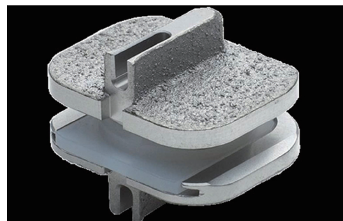
Fig. 3. ProDisc-C artificial cervical disc.