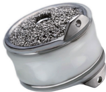
Fig. 2. Bryan artificial cervical disc.