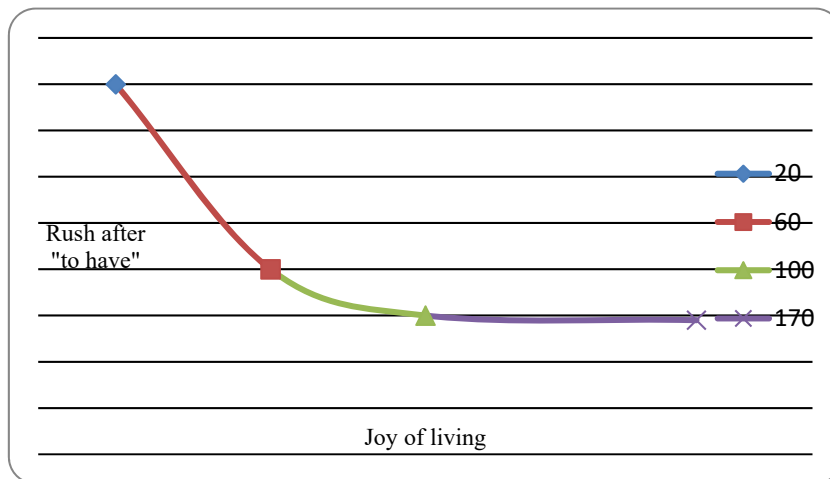
Figure 4. The convex combination material – spiritual

Creation is a living integer formed by the profound link between people, other species, the natural and created environment, finally, the whole universe. In “the chaos point”, Erwin Laszlo (2006) was talking about the threshold of some irreversibilities, when something unrepairable can break in the balance of planetary life. Thus, it is obvious that the leap of conscious is a most urgent need of our times, this is if we want to save what we still have. However, as Schopenhauer pointed, “we seldom think of what we have, but always of what we lack” (Schopenhauer, 1896). The leap of conscience proposes the return towards inside and discovering the joy of living in balanced material - spiritual dimension of existence. Contrarily, in our journey through life we risk coming across with the “existential void” that was analyzed by Frankl in his famous book.