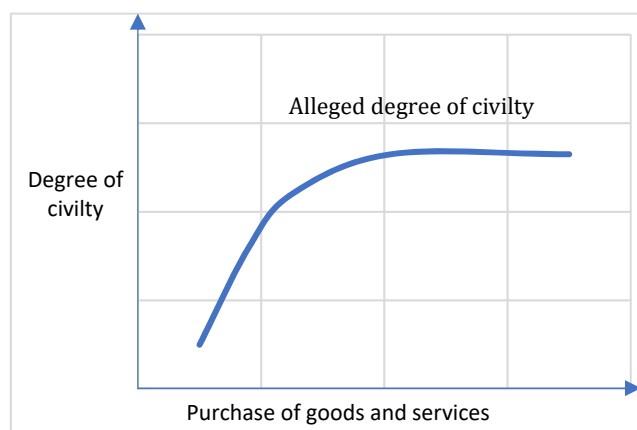
Figure 1. Alleged degree of civility

Therefore, society must protect you, thus appearing the idea of “consumer protection”. Behind it, stands a mountain of laws and regulations, and the attempt to apply them, through a heavy bureaucracy. But with all these measures taken to protect consumers from products