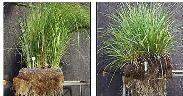
Figure 4 Plants from vegetated floating mats [29]

Additionally, climate change [30-31] and urbanization [29, 32] are believed to be two of the main reasons for urban flooding. Many researchers have found that the frequency and magnitude of flooding are increasing as a result of climate change. Concurrently, urbanization plays an important role in degrading the quality of stormwater. Therefore, SUDS can be an effective solution to aforementioned issues of stormwater runoff.