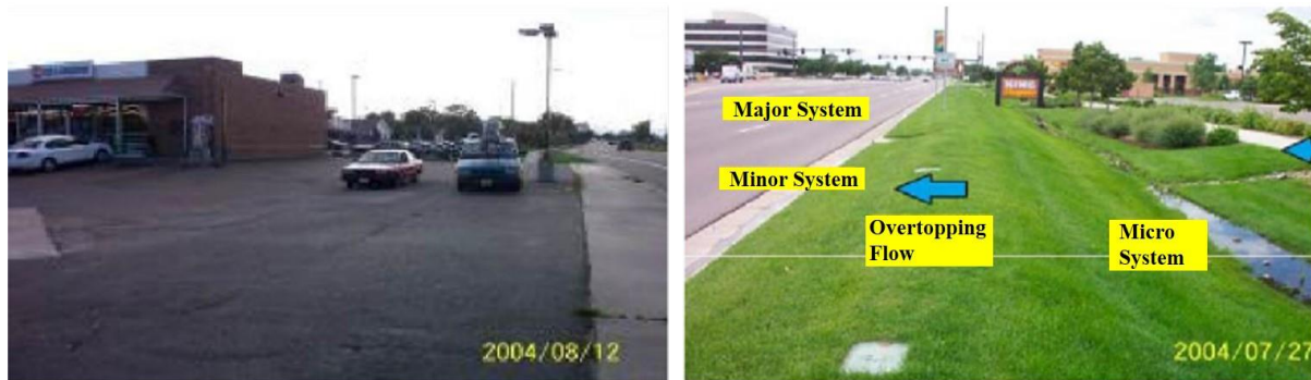
Minor and Major System