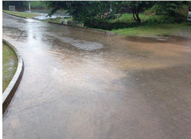
Figure 1 Accumulated stormwater at the Sri Lanka Institute of Information Technology (SLIIT)

and filling in of natural ponds and streams. These directly increase the impervious area. Some studies show that impervious area increased by about 255% over a 34 year period. This research work was carried in the Snohomish water resources area of western Washington. It clearly shows the adverse impact to surface water runoff [10]. The situation is much worse in China. The amount of urbanized land increased by 43.46% in the years 2000 to 2008 in China. However, the impervious area increased by 53.30% in the same period [11]. This is a good example showing the relationship between urbanization and increased impervious area. Figure 2 further illustrates the temporal variation of impervious area in Urumqi, China from 1990 to 2010 [12]. Impervious area increased from 25% to 63% over 20 years.