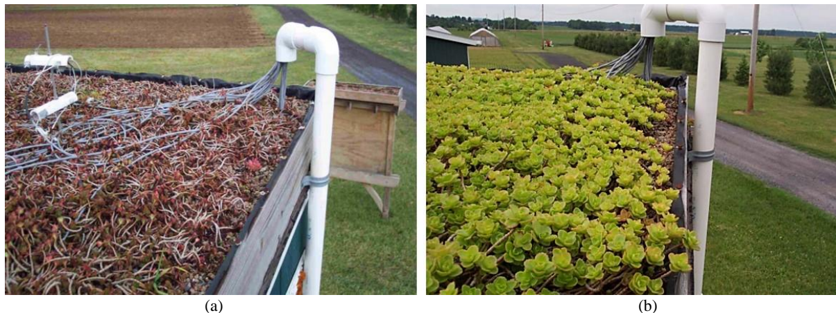
Figure 6 An example of a green roof in a SUDS: (a) in November 2003 and (b) in June 2005 [57]

Figure 6 [57] shows green roofs that were tested by the United States Environmental Protection Agency (US EPA). Successful application of green roofs can be clearly seen by