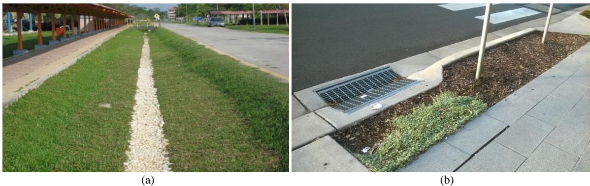
Figure 3 a: An ecological swale with river gravel making up a flow channel [26]; b: SUDS at the Royal North Shore Hospital, Sydney, Australia

Figure 3a shows an ecological swale [26] developed by the University of Sains in Malaysia to simultaneously reduce surface runoff velocity and increase infiltration. River gravel was used to enhance the porosity of the contact ground to increase the infiltration.