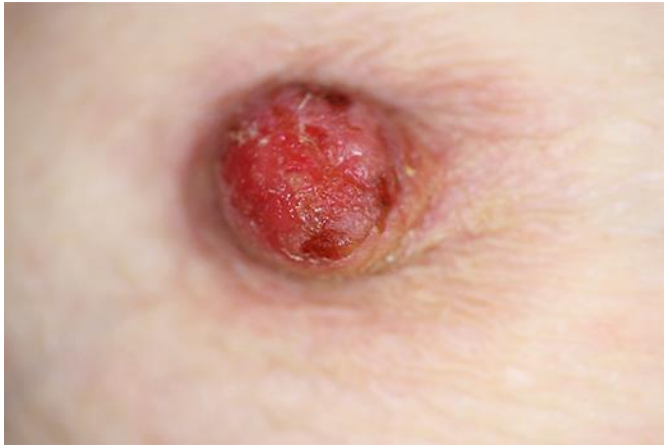
Fig. 1. The epidermis of the right nipple was inflamed and swollen with occasional bleeding.