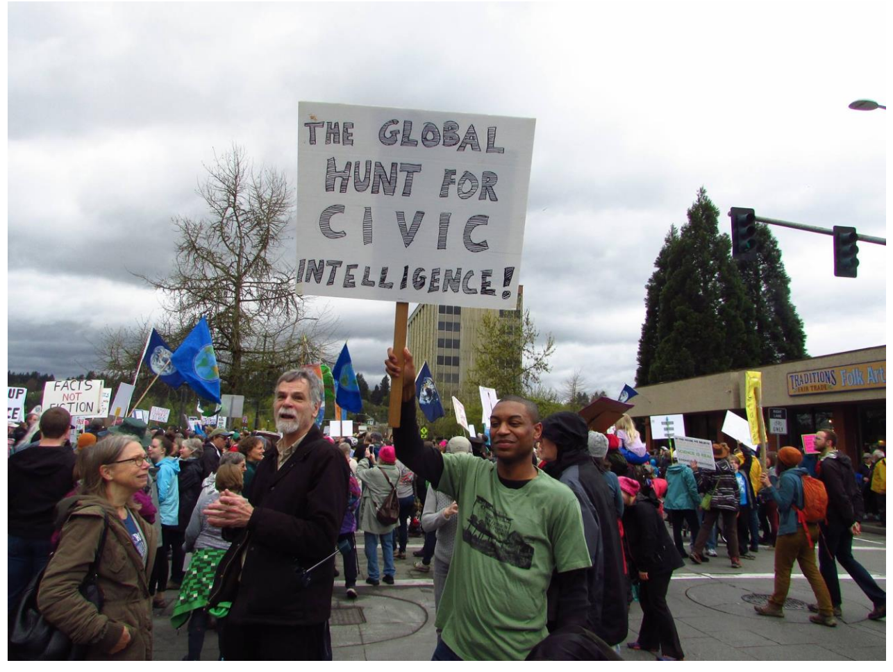
GLOBAL HUNT FOR CIVIC INTELLIGENCE AT THE MARCH FOR SCIENCE