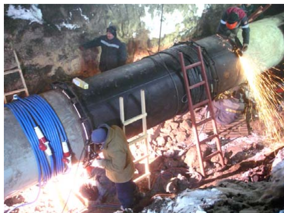
Fig. 9. Repair works on the main gas pipeline DU 1200×12 mm «Urengoy-Pomari-Uzhgorod» using the technology of demagnetization of welding joints developed at the ITPM of the National Academy of Sciences of Ukraine (Ternopil, 2017)

relevant developments have been completed in this direction, among which the following can be noted: