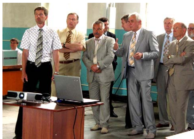
Fig. 6. Scientific presentation by the Corresponding Member of the NASU V.Yu. Rozov which is devoted to the 40th anniversary of the founding of the STC MTO of the NAS of Ukraine (Kharkiv, 2010)

of Ukraine) with the rights of a research Institute. In 2010, the institution celebrated its 40th anniversary (Fig. 6).