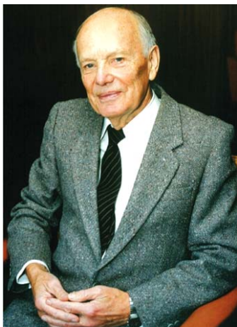
Fig. 2. The current President of the National Academy of Sciences of Ukraine, outstanding scientist in the field of electric welding of materials, Academician of NAS of Ukraine B.Ye. Paton (born on November 27, 1918)

During the long history as the Presidents of the Academy were elected [2]: M.P. Vasilenko (1921-1922), O.I. Levitsky (1922), V.I. Lipsky (1922-1928), D.K. Zabolotny (1928-1929), O.O. Bogomolets (1930-1946), and O.V. Palladin (1946-1962). Since 1962 the Academy is headed by B.Ye. Paton (Fig. 2).