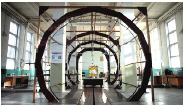
Fig. 7. A unique magnetometric stand of the object of the national heritage of Ukraine «Magnetodynamic complex» of the Institute of Technical Problems of Magnetism of the National Academy of Sciences of Ukraine (Kharkiv)

Among the most important applied results of the ITMM, it is possible to note the creation and introduction in the Magnetodynamic complex of the Institute of industrial technology of a high-precision measurement of the magnetic characteristics of spacecrafts developed by the State Enterprise «Design Office «Pivdenne» [14]. The developed technology became an integral part of the technology of the creation of domestic spacecrafts and allowed to provide high-quality magnetic control of spacecrafts of types «Microsatellite», «EgiptSat-1», «Sich-2» (Fig. 8), «Microsat», «Sich-2-1» and the development of a number of advanced spacecrafts in terms of their magnetic characteristics.