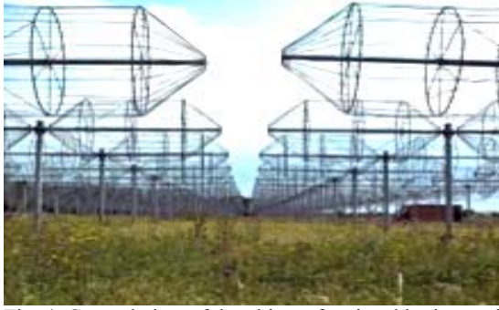
Fig. 4. General view of the object of national heritage of Ukraine «Radio telescope UTR-2 with the system of interferometers URAN» of the Radio Astronomical Institute of the National Academy of Sciences of Ukraine (Grakovo village, Kharkiv region)

Works by Academicians M.M. Krylov and M.M. Bogolyubov and their students are an outstanding contribution to the study of approximate methods of mathematical analysis and the theory of dynamical systems. These well-known in the world Ukrainian mathematicians have created a substantially new section in the field of mathematical physics – nonlinear mechanics. A significant contribution to domestic and world science is the research work by Academician G.F. Proscura on aerohydrodynamics and by Academician M.O. Lavrentiev on the geometric theory of functions of complex variable and its practical application for solving urgent modern technical problems of hydrodynamics and aerodynamics.