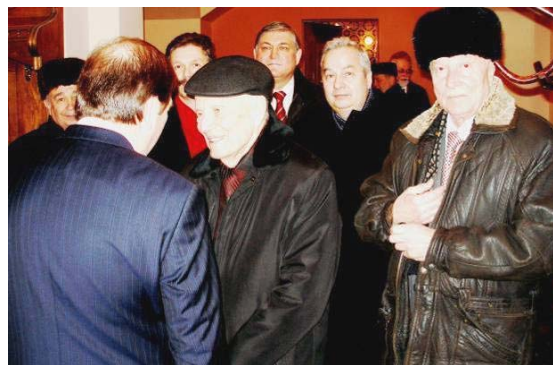
Fig. 3. Meeting of scientists of the NTU «KhPI» with the President of the National Academy of Sciences of Ukraine, Academician B.Ye. Paton after the award of the State Prizes of Ukraine in the field of science and technology for 2006 (Kyiv, Mariinsky Palace, February 2007)

Note that Academician B. Ye. Paton is the only head of the state Academy of Sciences in the world, who is its contemporary (the day of foundation of the Academy of Sciences of Ukraine and the day of his birth surprisingly coincide – November 27, 1918) [3]. Personal communication with this person-statesman leaves many years unforgettable impression (Fig. 3).