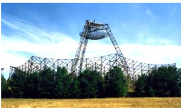
Fig. 5. Object of national heritage of Ukraine «Ionospheric probe» of the Institute of Ionosphere of the National Academy of Science and Ministry of Education and Science of Ukraine (Zmiev city, Kharkiv region)

Institute of Ionosphere of the National Academy of Sciences and Ministry of Education and Science of Ukraine. It is close to the NTU «KhPI» on the history and territorial location. It was founded in 1991 on the basis of the Department of Radio Electronics of the NTU «KhPI». This institute has a unique ionospheric observatory, the ionospheric probe of which is the object of the national heritage of Ukraine [11]. The general view of this unique object – the incoherent scattering (IS) radar with a parabolic antenna type NDA-100, whose diameter is equal to 100 m, is presented in Fig. 5 [12].