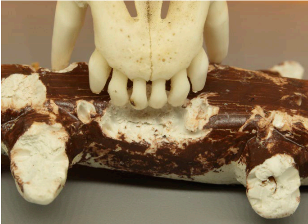
Fig. 1. Tooth prints left on plasticine models were compared with skulls and in this case red fox was identified as predator.