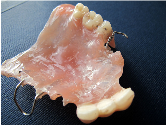
Fig. 3. Incorrect resin polymerization and finishing and polishing process. Mandible partial denture