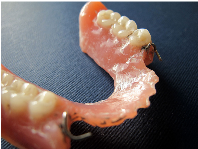
Fig. 4. Thick denture plate and incorrect interdental spaces