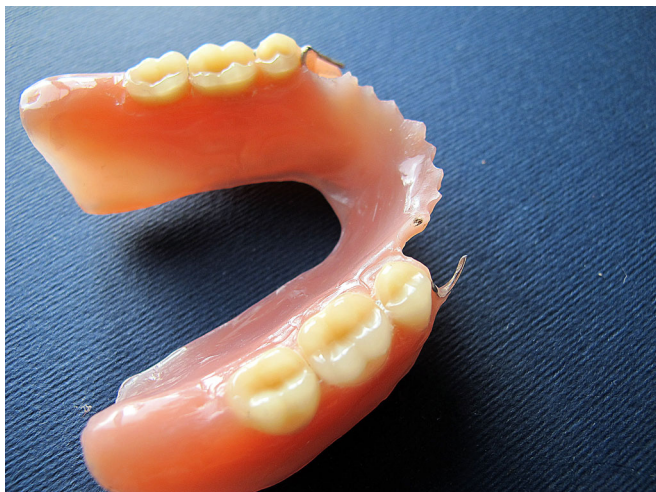
Fig. 8. Correct major connector, clasps and interdental spaces