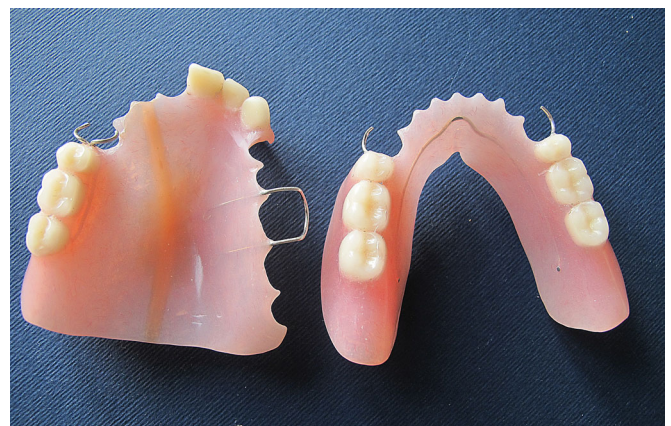
Fig. 1. Well produced maxillary and mandible partial dentures

The results showed correct resin polymerization (Fig. 2) in 61.9% (96 dentures) and 38.1% (59 dentures) incorrect resin polymerization (Fig. 3, 4). The results are similar to that about the criteria finishing and polishing process – correct finishing and polishing in 61.3% and incorrect in 38.7%.