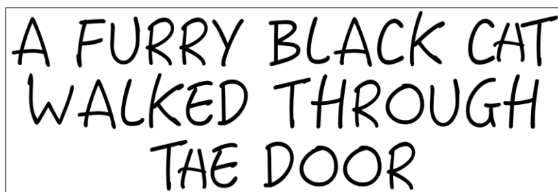
Figure 1: Illustration of a top-down perceptual phenomenon that does not seem voluntary or intentional (adapted from Selfridge, 1955). The “a” in “cat” and the “h” in the “the” have the same letter shape. However, people effortlessly see the words “CAT” and “THE” rather than “CHT” and “TAE”.

Using “top-down” to mean “voluntary” is just not the correct way to use these terms. But, we can understand why the term “top-down” can be confusing. Attention capture researchers often use imprecise language, and we ourselves have been certainly guilty of this. For example, we frequently used the phrase “goal-driven theory” when referring to theories in which intentions or expectations can indirectly lead to the capture of attention by stimuli that shared features with the target (Gaspelin, Leonard, & Luck, 2015, 2017, Gaspelin & Luck, in press, 2018). We did not mean to imply that the observers had the goal of focusing attention on these stimuli. Instead, we assumed that the explicit task goal triggered a cascade of events that led ultimately to the capture stimuli that matched the features of the target but were entirely task irrelevant (see Folk, Remington, & Johnston, 1992, for a particularly clear formulation). However, we never made this logic explicit, and it is easy to understand that the term goal-driven could be taken to imply direct, voluntary control of attention. And herein lies the problem – common terminology in this area can easily be misinterpreted.