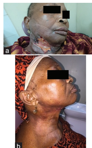
Figure 1: a) Necrotizing fasciitis, involving the right submandibular and cervical regions secondary to an odontogenic infection. b) Healing by secondary intention after serial debridement.

Clinical examination revealed a conscious and alert man in mild respiratory distress (27 cycles/min) with a pulse rate of 86 beats/min and blood pressure of 110/70 mm Hg. He was acyanosed, anicteric, afebrile (36.8 °C), and not dehydrated. Extraoral examination showed bilateral submandibular swelling with associated anterior neck swelling, which was diffuse, firm to touch, and tender. Additionally, the overlying skin appeared hyperemic. Intraoral examination demonstrated a mild trismus (about