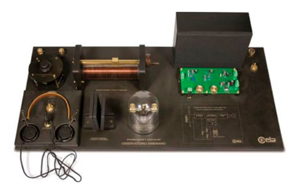
Figure 4. Radio receiver built in 1912, the model of it is in the booklet Father Alfani dedicated to Marconi during his visit held in 1912.<sup>4</sup> The diode, head-phones and the capacitor are original.

S.p.A" executive, but also very keen on radio engineering. Since then a very methodical work has begun to recover, restore and put that Laboratory (Figure 3) back on its feet. It took about six/seven years to finish the work, but nowadays more than 95% of Father Alfani's Laboratory is on exhibit at the Ximeniano Observatory.<sup>4</sup> It is made of 44 parts ranging from the radiotelegraphy station built in 1912 and already depicted in Figure 4 to several other equipments dating back to 1940 and perfectly operative. The radiotelegraphy station has been restored by using the original Ducretet & Roger thermionic diode, which was found by chance in the Observatory's store-rooms. Actually the station has been tuned again so as to receive the national broadcast "RAI" in amplitude modulation. Another noteworthy article is the radio receiver dating back to 1923 and shown in Figure 5, with its original coherer.