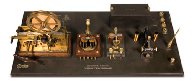
Figure 5. Radio receiver built in 1923 according to the model of Marconi's receiver dating back to 1895.<sup>4</sup> A part from the battery box, all the other components like the coherer (right lower part, near to the antenna) are original.

S.p.A" executive, but also very keen on radio engineering. Since then a very methodical work has begun to recover, restore and put that Laboratory (Figure 3) back on its feet. It took about six/seven years to finish the work, but nowadays more than 95% of Father Alfani's Laboratory is on exhibit at the Ximeniano Observatory.<sup>4</sup> It is made of 44 parts ranging from the radiotelegraphy station built in 1912 and already depicted in Figure 4 to several other equipments dating back to 1940 and perfectly operative. The radiotelegraphy station has been restored by using the original Ducretet & Roger thermionic diode, which was found by chance in the Observatory's store-rooms. Actually the station has been tuned again so as to receive the national broadcast "RAI" in amplitude modulation. Another noteworthy article is the radio receiver dating back to 1923 and shown in Figure 5, with its original coherer.