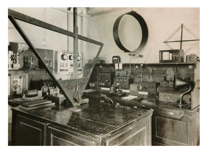
Figure 3. The radiotelegraphy station of Father Alfani at the Ximeniano Observatory.<sup>2</sup>