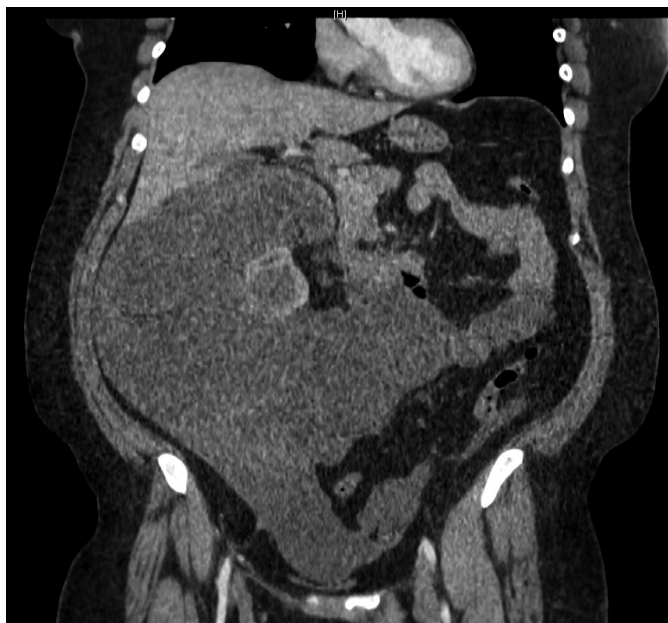
Figure 1. Coronal section of computed tomography abdomen demonstrating large mass arising from right kidney

The management and treatment of adult Wilms' tumor is customarily multimodal and includes surgical, multi-drug chemotherapy and/or radiation. Treatment protocols are