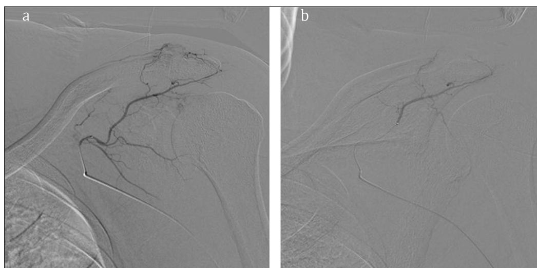
Figure 1: Transarterial treatment of frozen shoulder by particle embolization. a) Selective catheterization of thoracoacromial artery from the left subclavian. b) Control after superselective injection of 1.5 g of imipenem-cilastatin. Early results of this new therapeutic concept seem promising.