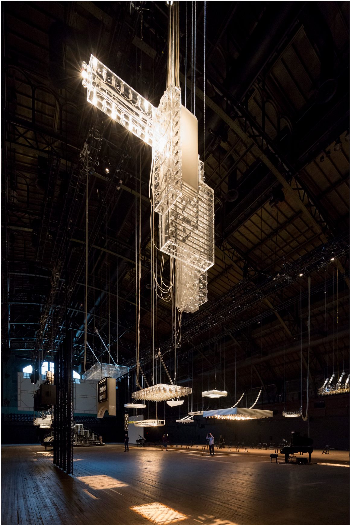
Figure 4: Installation view of H {N}Y P N{Y} OSIS at Park Avenue Armory, by Philippe Parreno.