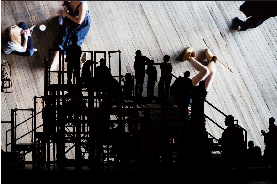
Figure 5: Installation view of H {N}Y P N{Y} OSIS at Park Avenue Armory, by Philippe Parreno.

are moved around the dark and smoke-filled space as the camera follows them in a peculiar semi-apocalyptic and phantasmagoric choreography. To Armory visitors the film feels like watching their own presence in a seemingly foreseeable future. As Randy Kennedy (2015) has noted: ‘ The Crowd is a film made in the past depicting a future that is their present’, in other words: past, present and future are all happening at once. 12