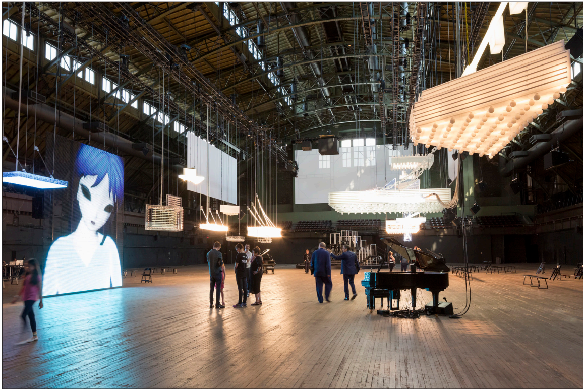
Figure 3: Installation view of H {N}Y P N{Y} OSIS at Park Avenue Armory, by Philippe Parreno.

26 light sculptures that recall old-fashioned illuminated theater marquees organize the interior of the Armory, forming a spectral sort of theater-lined street. The 'corridor' takes us to a circular platform with bleachers that rotates slowly and allows us to see (and to be seen). Up to three screens, with films or colors projected on them, roll up and down around the platform. Two grand pianos, one of them playing on its own, some scattered chairs and a system of blinds that permit or prevent light from entering the hall, complete the scene.