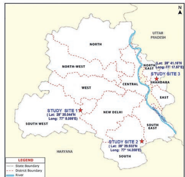
Figure 1. Map of Delhi showing the study sites with latitude and longitude.

The temperature of water in different containers was generally lower than the temperature of air recorded by HOBO (Figure 2). The mean monthly temperature of water varied from 16.9 to 33.0 °C in tin containers, 17.3 to 35.6 °C in plastic containers, 14.3 to 28.5 °C in ceramic pots, 23.3 to 30.4 °C in cemented UGTs and 15.8 to 35.1 °C in cemented OHTs (Table 1). Corresponding values for the air temperature ranged from 17.7 to 36.1 °C. Temperature of water in cemented UGTs was observed to be higher than the temperature of air from October to March. Further, the difference between the water temperature in containers and air temperature was highest for ceramic pots. Daily mean, maximum and minimum temperatures recorded by different data loggers differed significantly ( P < 0.05 ). When results were analysed using Tukey HSD test, significant differences were observed between the daily mean air temperature and water temperature in different containers such as tin, ceramic pot and cemented OHT (Tables 1 and 2). Similarly, daily maximum and minimum air temperatures differed significantly ( P < 0.05 ) from water temperature in tin, ceramic pots and cemented OHT. Interestingly, the difference between air and water temperature in plastic containers was insignificant for the mean,