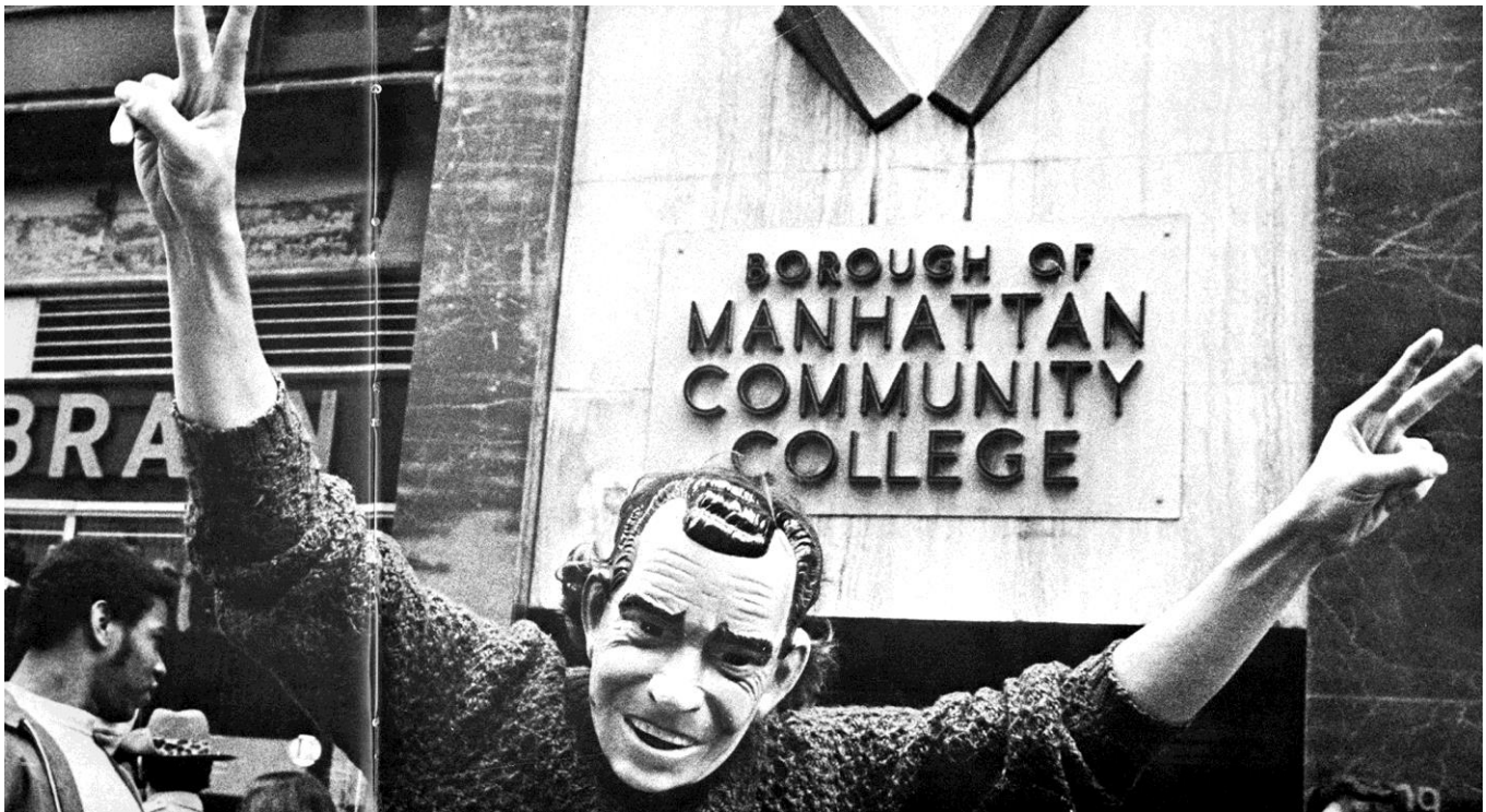
"STUDENT WEARING NIXON MASK,"