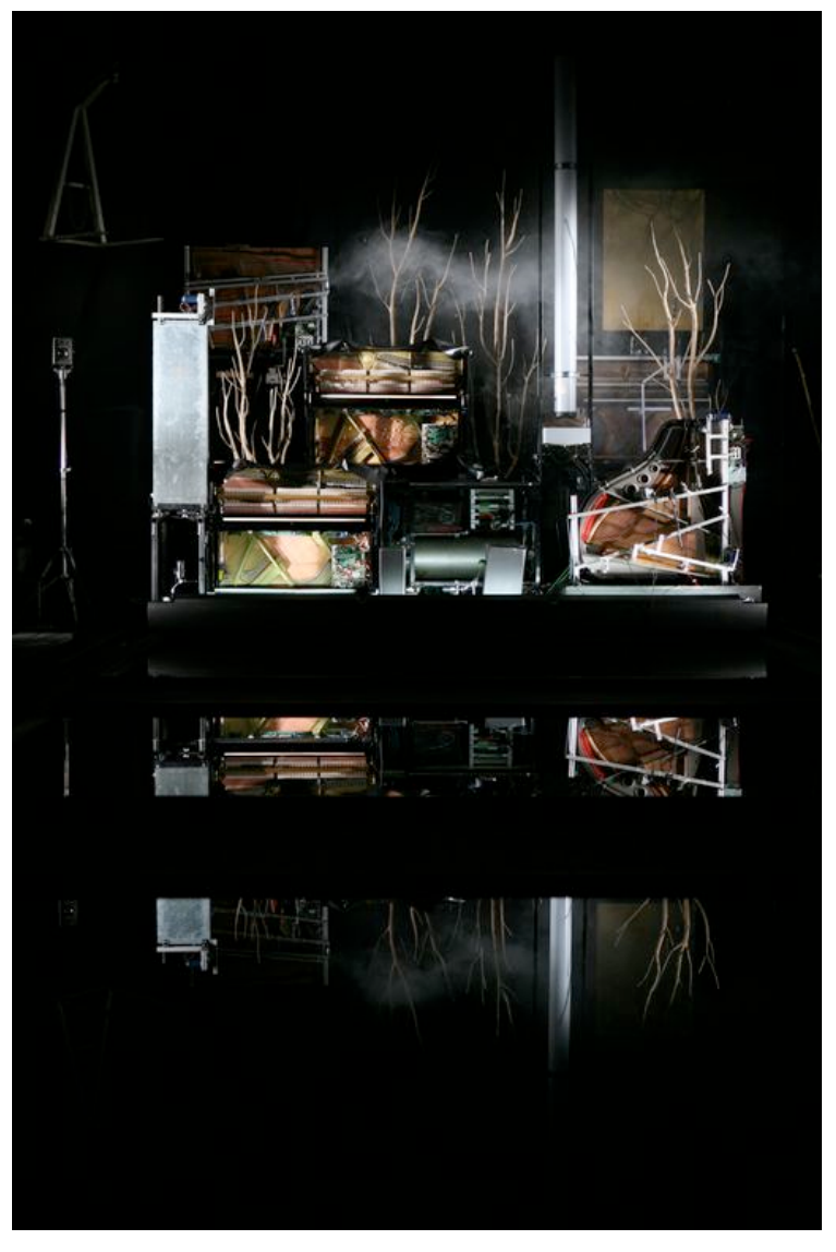
Stifters Dinge, by Heiner Goebbels. Frontal view of the water basins and prepared pianos at back, reflected in the water.

Some of the other voices we hear are almost unintelligible, not crisp and clear like the Stifter narrative but more muffled, disturbed through deep rhythmic beats and a moving small screen in the foreground, roaming around again invisibly driven by a motorized pulley system, searching for fragments of the second painting projected all over the back (where we cannot decipher it). We only see the 'close-up' captured on the small moving screen – down, down a little further, then across to the right, then to the left, as if scanning the image (Paolo Ucello's Night Hunt , circa 1460, painted in tempera on wood, in the Ashmolean Museum collection in Oxford). Again, this is a perplexingly beautiful moment, a kinetic screen scanning an image, in a virtual osmosis of foreground and background projection space.