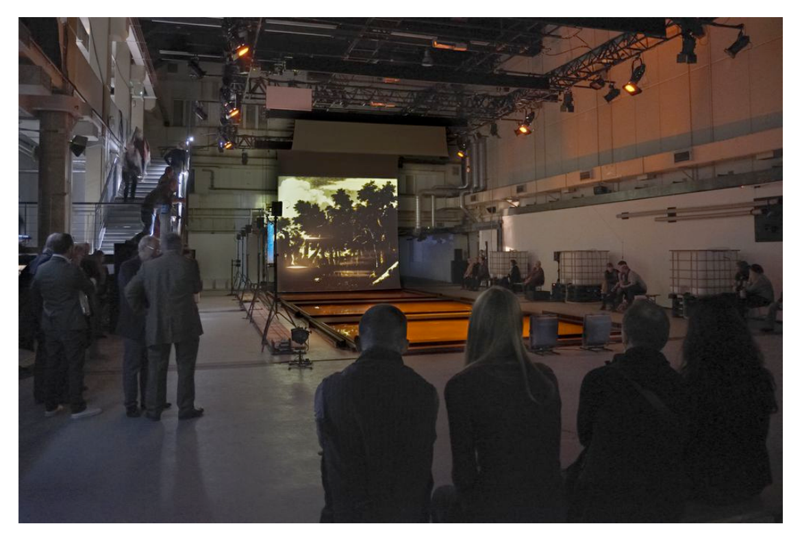
Stifters Dinge , by Heiner Goebbels. View of the water basins, reservoirs, and van Ruisdael's projected painting, with visitors during the Unguided Tour © 2012 Courtesy of Artangel. Photo: Ewa Herzog.

Goebbels's machine thrives on these transformative moments when the scene escapes our grasp or resists our projections into the phantasmatic core of this mute and yet mutable landscape. Other memorable and complex scenes arise from the play of different languages we hear, for example a radio conversation in French between an interviewer and ethnologist Claude Lévi-Strauss which begins with insistent questions regarding the last undiscovered places on earth (Lévi-Strauss suggests there are none left), while the grand piano appeared to be smoking or creating a dimly lit piano environment reminiscent of a smokey jazz club in the 1930s perhaps. On the subject of relations to other human beings, Lévi-Strauss notes that he had lost faith in humanity, and if he had wanted friends he would have sought them out but instead he prefers to acknowledge: 'I am solitary by nature...'