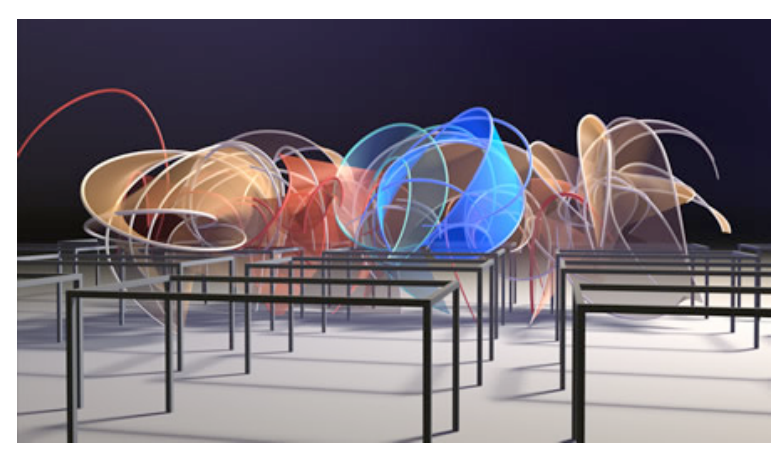
3D Alignment Forms within Synchronous Objects , taking a sampling of dancers' alignments into three-dimensional space creating volumes between them to generate new sculptural-spatial configurations. Video still from http://synchronousobjects.osu.edu/.

kinetic modulator. Noticeably, One Flat Thing, reproduced is performed on unusual spatial ground: twenty tables form the matrix of choreographic space and the topological grid for some of the sculptural data processing and vector graphics in Synchronous Objects .