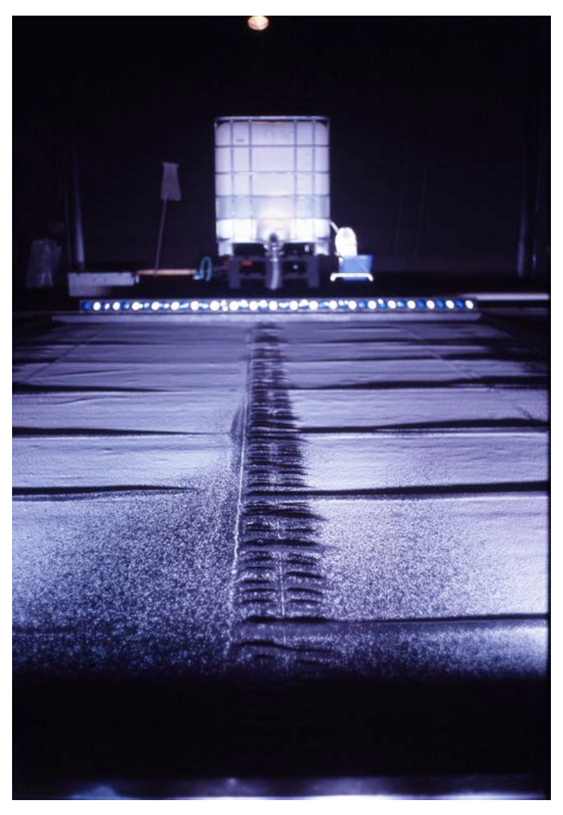
Stifters Dinge, by Heiner Goebbels. Side-ways view of the water basins and reservoirs.

positioned at the edge of the first basin; the container is handed back to the other technician. The two hold the sieve on either end and begin the process of sifting salt, a process that generates a subtle and grainy sonic texture as fine salty grains hit the tarpaulin surface, and an anticipation of what is to come. This is repeated twice more to complete the adding of salt to the three basins.