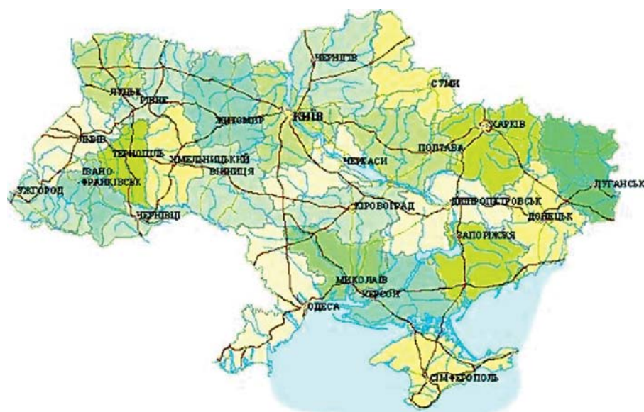
Fig. 1. The network of Ukrainian highways of general use