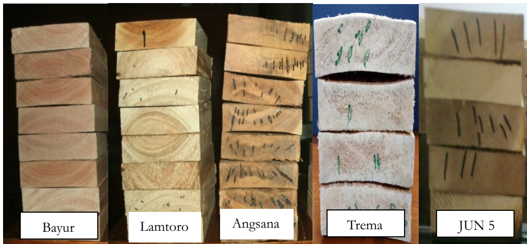
Figure 1. The honeycomb was found merely in angšana, lamtoro and fast-growing JUN teak and not in trema, bayur and jabon (picture was not taken) 1

Gambar 1. Pecah dalam ditemukan pada kayu angšana, lamtoro, dan jati JUN cepat tumbuh; dan tidak dijumpai pada kayu trema, bayur, dan jabon (Foto untuk jabon tidak diambil)