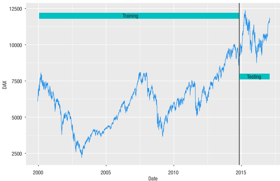
Figure 2. German DAX-30 performance during the period analysed (8th December 1999 to 30th January 2017)

The information in the database is used to calculate the technical analysis indicators and oscillators described in Table 1. As already mentioned in the introduction, it is very common to use technical analysis indicators to predict price evolution. In fact, all research papers cited include among the input variables some technical indicators. These previous studies have been considered to select the indicators in our research.