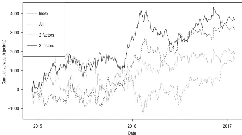
Figure 4. Cumulative wealth of the investment strategy vs. DAX-30

Figure 4 shows the cumulative wealth achieved by the strategy in the out-of-sample period, from December 2014 to January 2017, when implementing Model A (all technical indicators are included), Model B (two factors) and Model C (three factors). For clarity reasons, we omit plotting the results obtained by models D and E. In any case, they are in line with those by Model B and Model C. Nevertheless, it must be stressed that regardless the similar hit ratio of the factor models, the evolution of the cumulative wealth may be quite different during the period analysed. Figure 4 reveals that such is the case for models B and C.