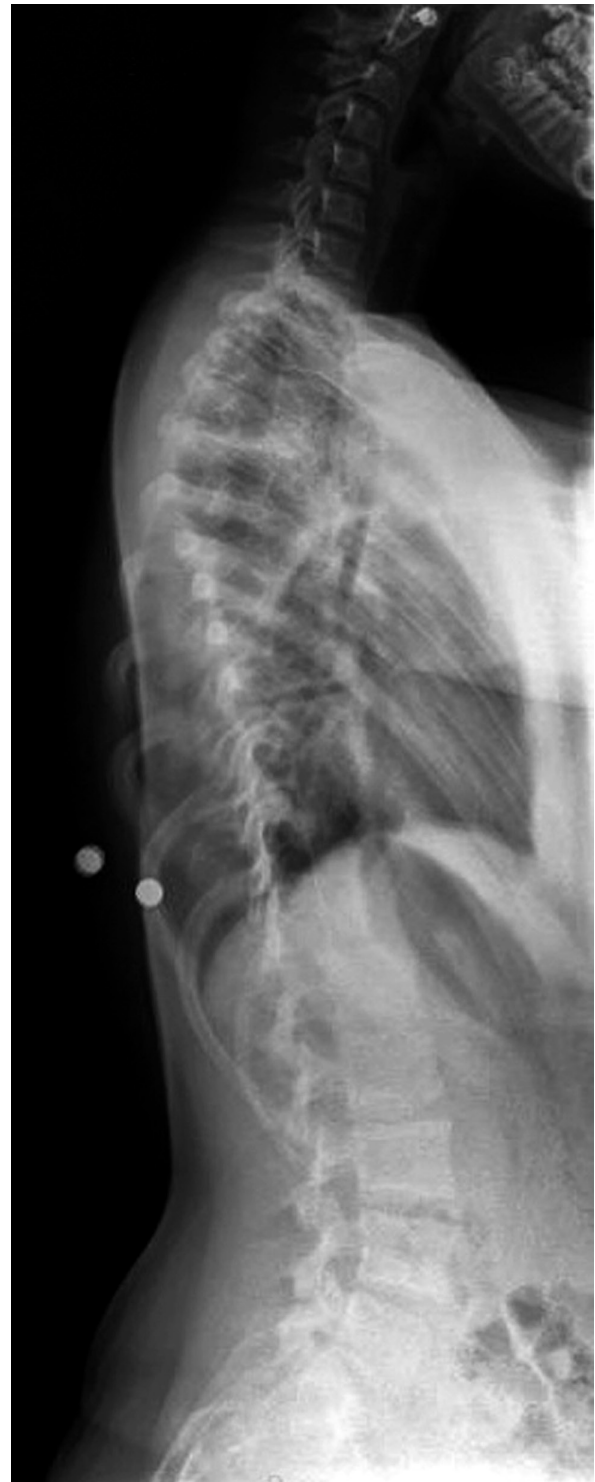
Fig. 2. Preoperative lateral whole spine.