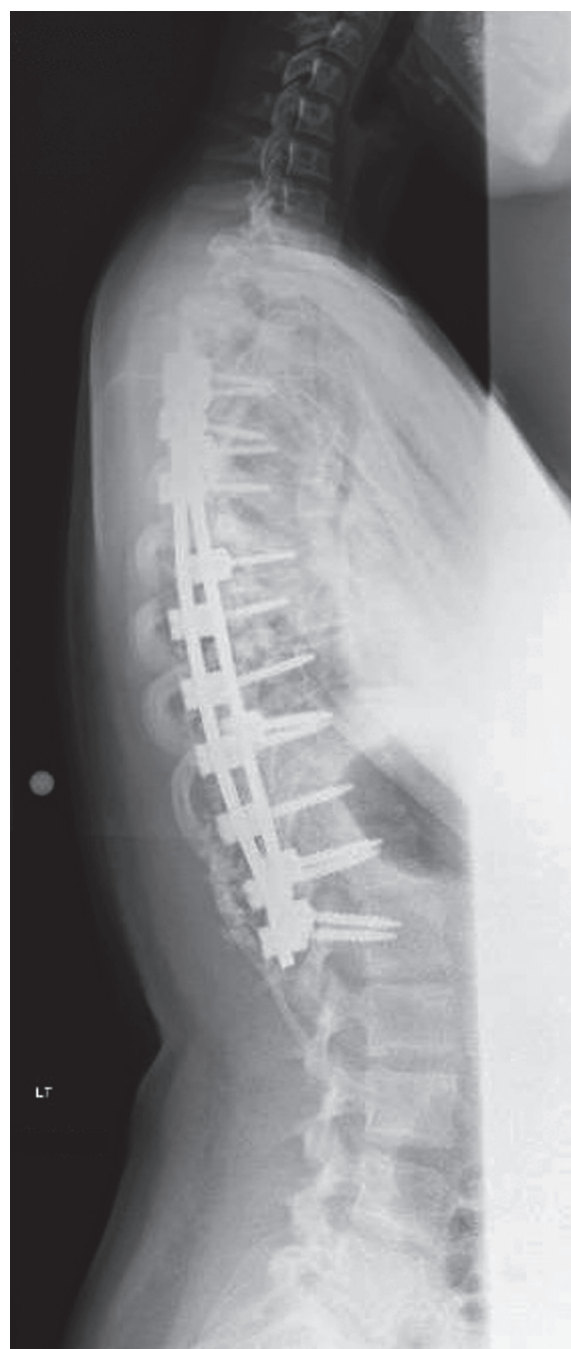
Fig. 4. Postoperative lateral whole spine.