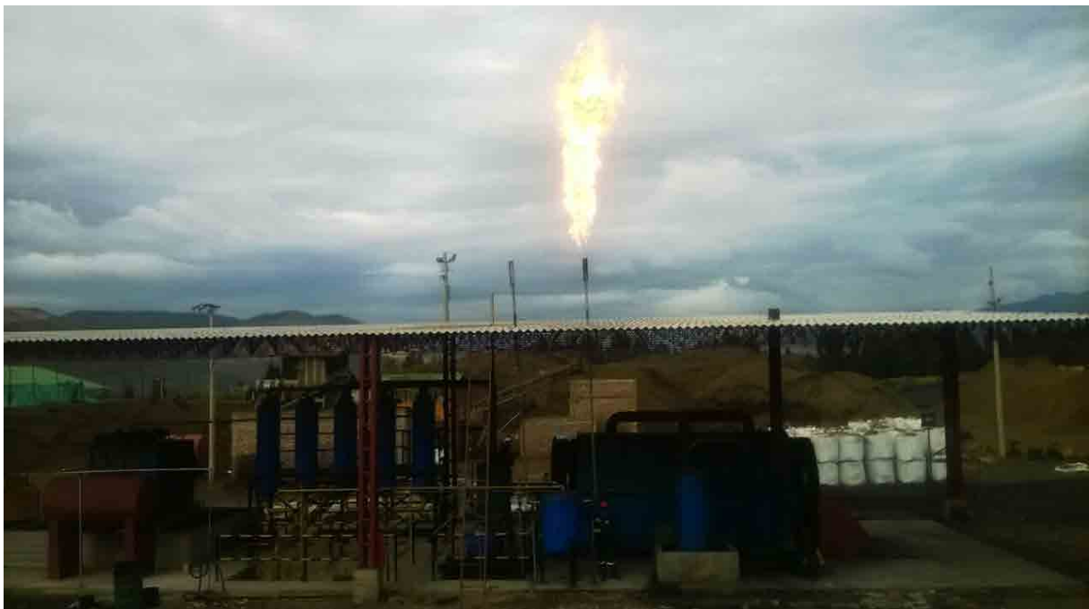
FIG. 4. Pyrolysis plant working and showing the synthesis gas emission.