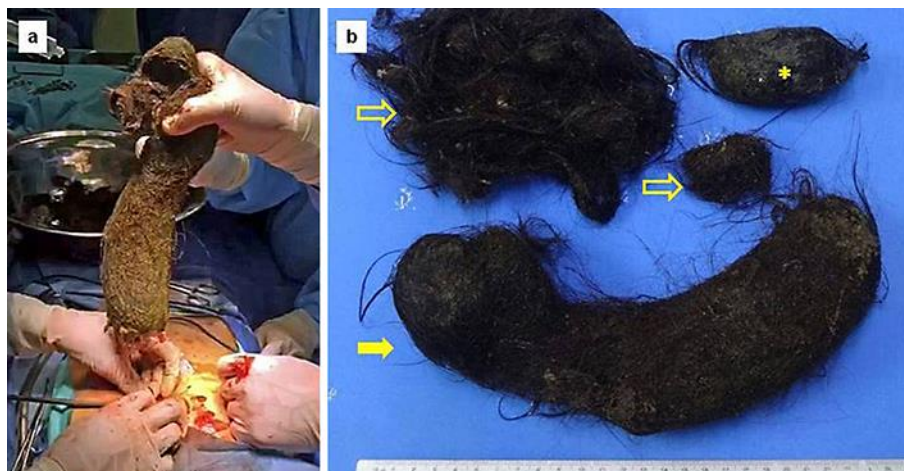
Fig. 2. a At gastrotomy, a 3-kg trichobezoar was removed. b The trichobezoar removed from the stomach (arrow) had a dense tail extending to the duodenum (hollow arrows). The trichobezoar removed from the ileocecal valve measured 7.5 × 4 cm (asterisk).