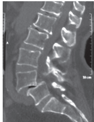
Fig. 2. Lateral (sagittal) lumbar vertebral computed tomography scan reveals the lytic segment at L4–L5 level.

the other patients. Four patients were long-time smokers and smoked a pack of cigarettes per day. The fusion rate was 95% under these conditions.