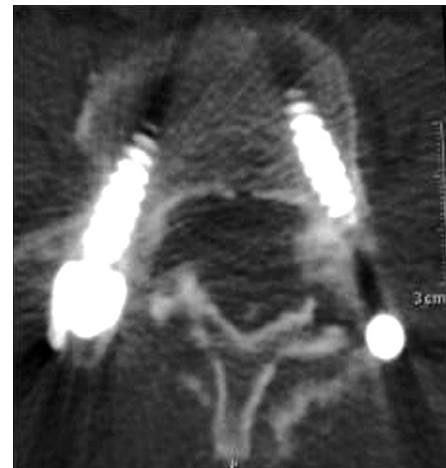
Fig. 6. The laminae 3 months after replacement viewed in an axial lumbar vertebral computed tomography scan.