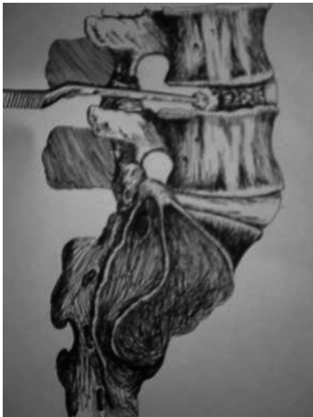
Fig. 4. Allograft insertion to the intervertebral space.

laminae were removed en-bloc (Fig. 3). After aggressive discectomy, allograft bone particles were inserted in the intervertebral disc space (Fig. 4). The pedicle screws were placed and tightened at the compressive phase and laminae were reinserted between the rods. The operation was ended after the placement of a drain. The early X-ray and sagittal lumbar vertebral CT scan revealed complete reduction (Fig. 5). Early first year and fifth year axial lumbar vertebral CT scans reveal the position of the laminae (Figs. 6, 7). The VAS score was 1 and Prolo score was 15%.