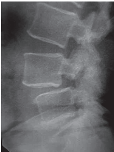
Fig. 1. Lateral X-ray shows the lytic segment at L4–L5 level.