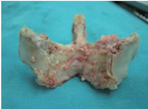
Fig. 3. The laminae after en-bloc resection.