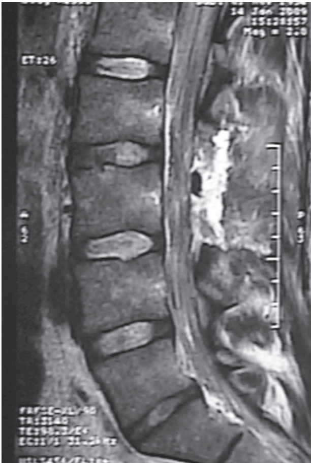
Fig. 4. Postoperative lumbar sagittal magnetic resonance imaging at the L2–L3 vertebral level.

progressive vision loss and, finally, total amaurosis. Its pathophysiology is not fully understood. Etiologically, occlusion in the major venous sinuses, growth hormone treatment, hypervitaminosis A, hypovitaminosis A, oral contraceptive use and a sudden decrease in corticosteroid levels are held responsible for the disease. Acetazolamide, lumbo-peritoneal shunt implantation and optic nerve sheath decompression are performed for treatment [10].